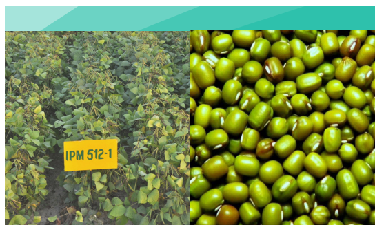
IPM512-1 (Soorya): Field view and grains

Owing to these qualities, this variety will offer a better option to farmers for cultivation in during Spring season and provide a superior alternative to IPM 99-125 (Meha) after a gap of >15 years.