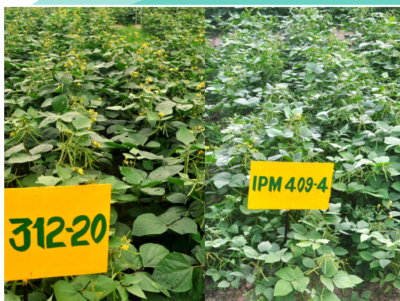
IPM 312-20 (Vasudha) and IPM 409-4 (Heera) in the field.

Both these varieties will offer suitable choice to farmers of Uttar Pradesh for cultivation during Spring season.