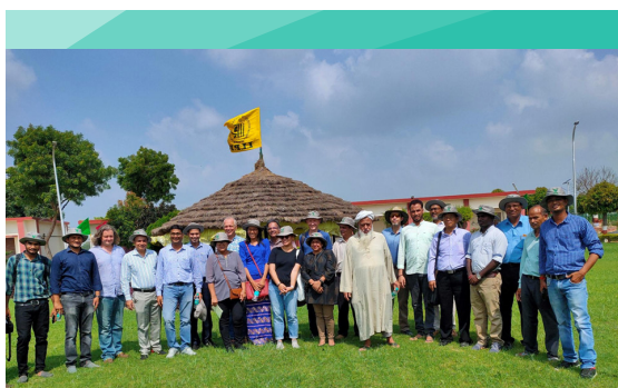
Project partners at the IMIN Annual planning meeting

Discussions were also held on the extension phase of the project till June 2020 and additional activities were underpinned for this phase. A tentative work plan as well as inclusion of new partners in phase 2 of the project were considered. The meeting ended with a pledge to foster mungbean research and development to enhance its global impact in nutritional and socio-economic security of the masses.