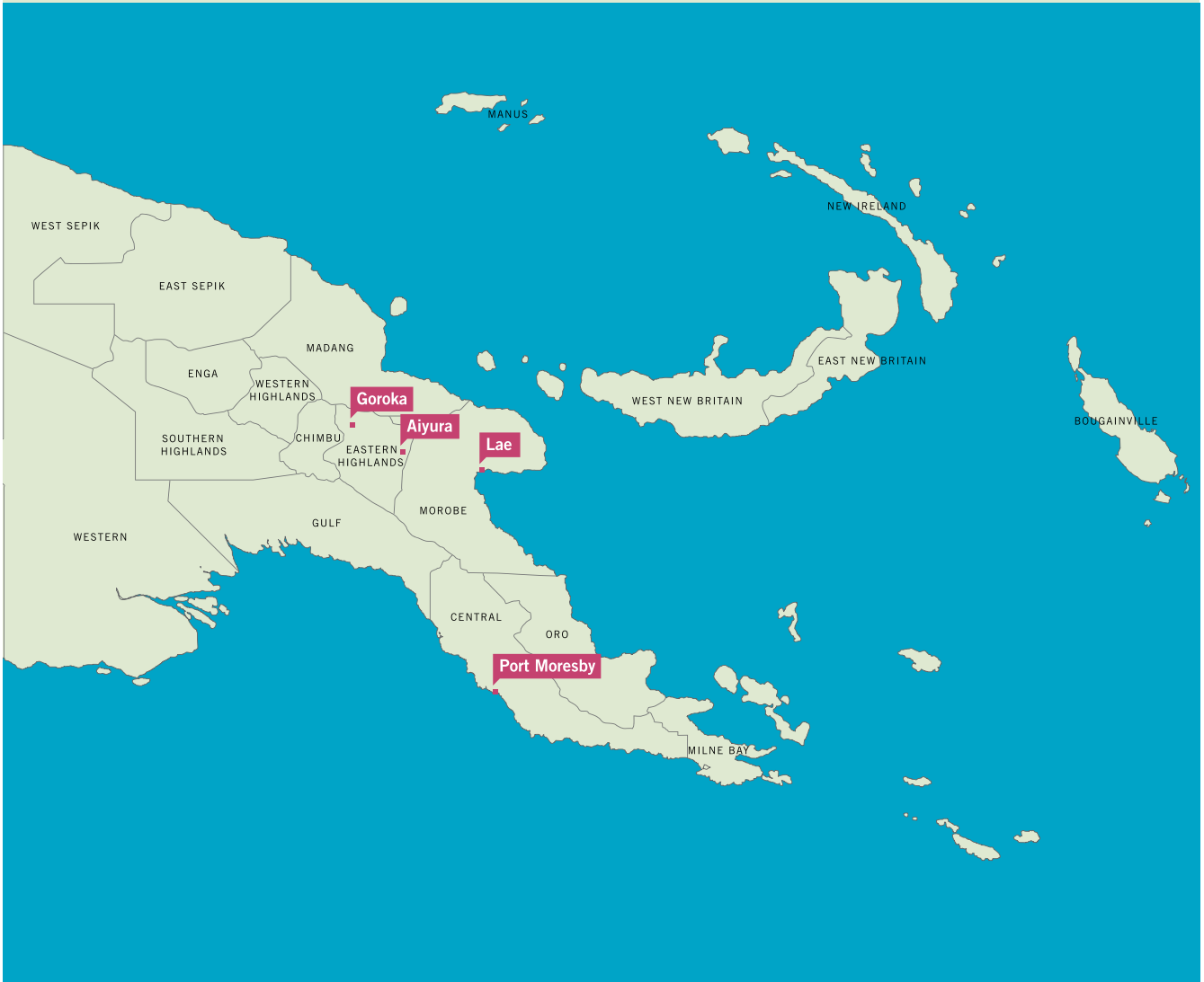
Map of Papua New Guinea showing provinces and the key cities and towns associated with freshwater fish farming