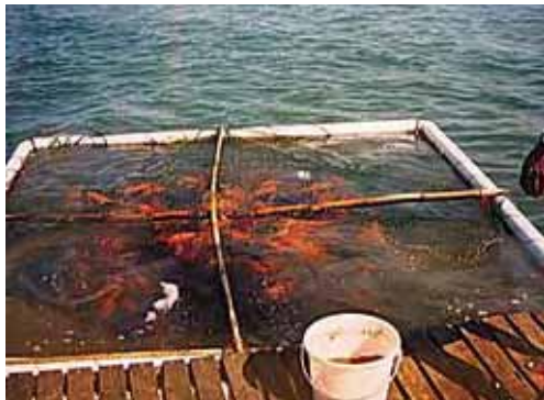
Feed trials by officers of HAQDEC under JICA's supervision were carried out with cages of common carp in Yonki Reservoir (1998–2001).

During 2000–06 the Asian Development Bank (ADB) funded fish farmer training courses in Morobe province and EHP. ADB makes contracts with advanced farmers or experienced officers who then train fish farmers at locations that are central to village communities (Solato 2005). Also, ACIAR projects commenced training programs for smallholder fish farmers in 2005.