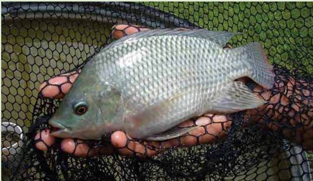
The genetically improved farmed tilapia (GIFT) strain of Oreochromis niloticus was first distributed from the Highlands Aquaculture Development Centre, Aiyura, to fish farmers in October 2002. This fish is overcoming chronic production bottlenecks because of its ability to grow rapidly and produce fingerlings in earthen ponds.