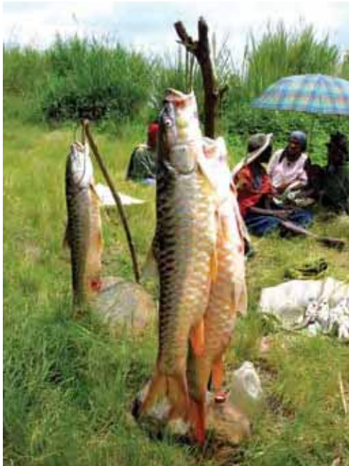
Specimens of golden mahseer ( Tor putitora ). Fish weighing approximately 5 kg were caught by net in Yonki Reservoir at night in February 2006 and sold the next morning at a roadside market for K25. Female fish had roe and are descendants of broodstock released by the FISHAID project of FAO in the mid 1990s.

of the distribution and abundance of introduced species would be helpful. It should include studies of both benefits for villagers and impacts on biodiversity of native fish stocks.