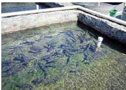
Rainbow trout, which were used as broodstock, at the Lake Pindi Yaundo Trout Farm and Hatchery. This hatchery is the main source of trout fingerlings for the highlands of PNG.

Highlands province (SHP) was the most developed with respect to inland fisheries. Trout was well established in the rivers and the trout hatchery in Mendi, SHP, produced approximately 350,000 fingerlings from eggs imported from Australia (Haines and Keller 1979a). The local councils purchased the fingerlings for K20 per 1,000 and released them into streams. After a number of attempts at pond aquaculture with rainbow trout by highland farmers, the Kotuni Trout Farm in Goroka, EHP, was established in 1973 and became the first successful trout farm in PNG. It produced 10 tons per year until it closed in 1984. The Lake Pindi Yaundo Trout Farm in Simbu province produced up to 5 tons per year, and in 1996 successfully produced trout fingerlings from its own broodstock, for the first time in PNG (Wani 1998). It was able to supply local small-scale trout farms until it closed down in 2002–03 because of feed problems, compensation claims and deteriorating roads. It reopened operations in 2005–06.