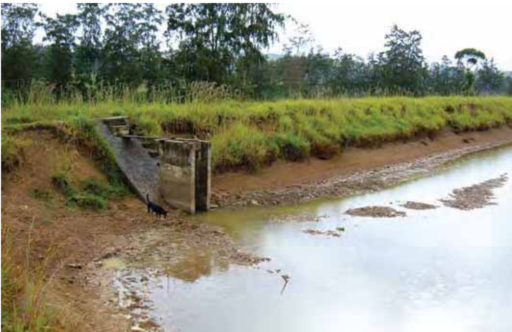
The water storage reservoir at HAQDEC, Aiyura, in the dry season. The water supply is seasonal and the water level falls to low levels during the dry period from April to September each year.