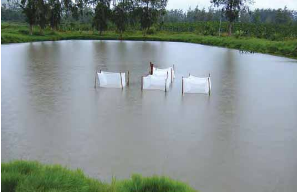
Pond at HAQDEC, Aiyura, in 2006. Happas are set up to hold GIFT fingerlings.