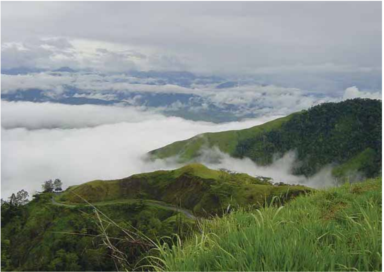
The view of the Markham Valley from the highlands of Papua New Guinea