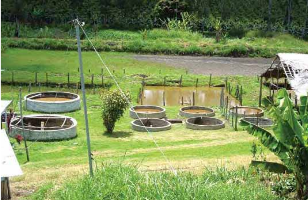
Broodstock tanks, spawning tanks and plankton ponds at the common carp hatchery at HAQDEC, Aiyura