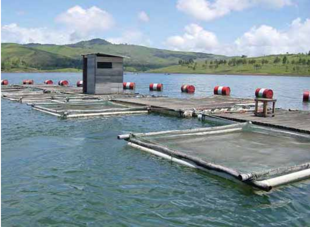
Research and extension facilities for cage culture at Yonki Reservoir

Committee (NADMAC), consisting of 10 members to provide advisory support to the managing director of NFA.