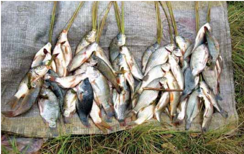
Common carp and tilapias caught in Yonki Reservoir, EHP, by a fisherman in November 2005

The fish species and numbers that were released into the Ramu–Sepik river system were: 173,111 of Tilapia rendalli (redbreast tilapia), 37 of Osphronemus goramy (giant gouramy), 27,750 of Puntius gonionotus (Java carp), 70,309 of Schizothorax richardsonii (snow trout), 29,827 of Tor putitora (golden mahseer), 11,224 of Acrossocheilus hexagonolepis (chocolate mahseer), 14,511 of Colossoma bidens (pacu) and 160,511 of Prochilodus marginatus (curimbata). Another fish, Barilius bendelesis (lesser baril), arrived without notice and was not solicited by the project, so the 150 fish of this species