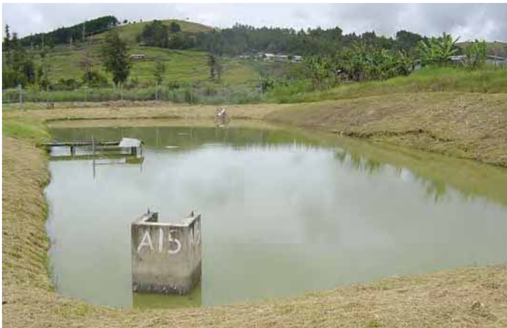
A pond at HAQDEC used to raise common carp