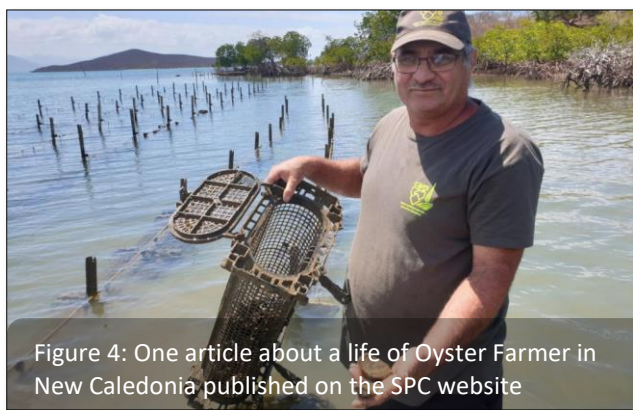
Figure 4: One article about a life of Oyster Farmer in New Caledonia published on the SPC website