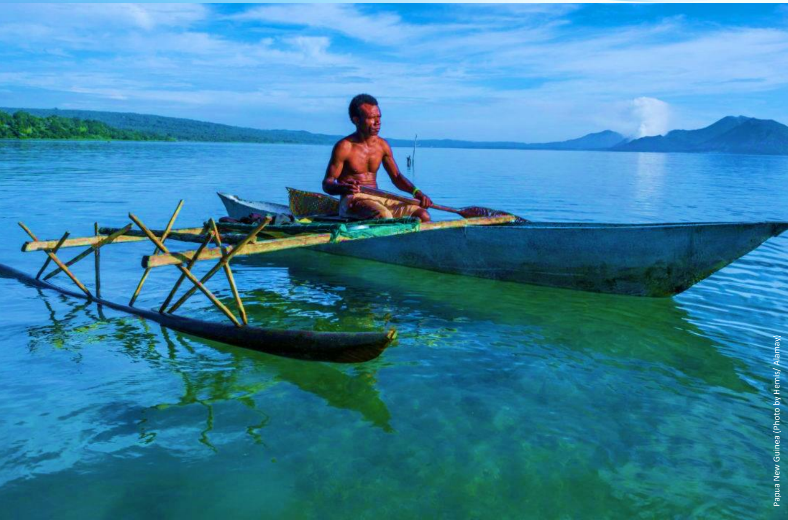
Papua New Guinea