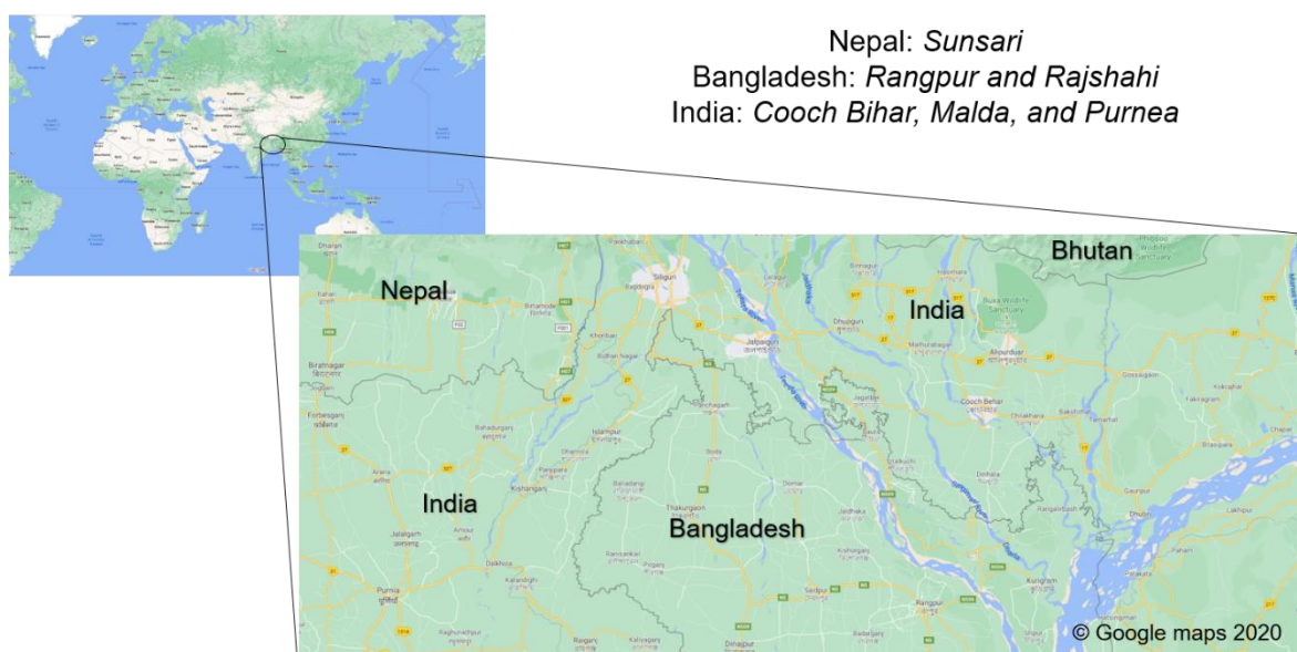
Figure 1: Location map, indicated in the world map.

As a supplementary project to SRFSI, data for this study were collected from SRFSI locations, which includes Sunsari district of Province 1 in Nepal, Cooch Bihar and Malda districts of West Bengal and Purnea district of Bihar in India, and Rangpur and Rajshahi districts in Bangladesh (Figure 1). CIMMYT, with the help of local partners and donor communities, has been working in these areas for a long time, engaging with local communities seeking viable livelihood opportunities for smallholders through conservation agriculture-based sustainable intensification.