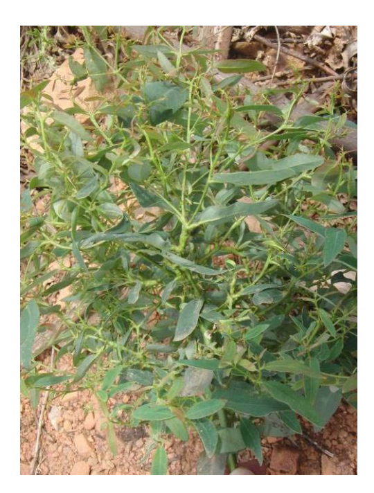
Figure 1: Seedling heavily infested with L. invasa galls. Seedling is beginning to lean over due to the weight of galls.