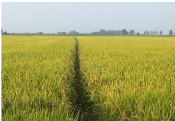
Figure 5. Seed production crop of new inbred rice variety Liaoning Province, China.