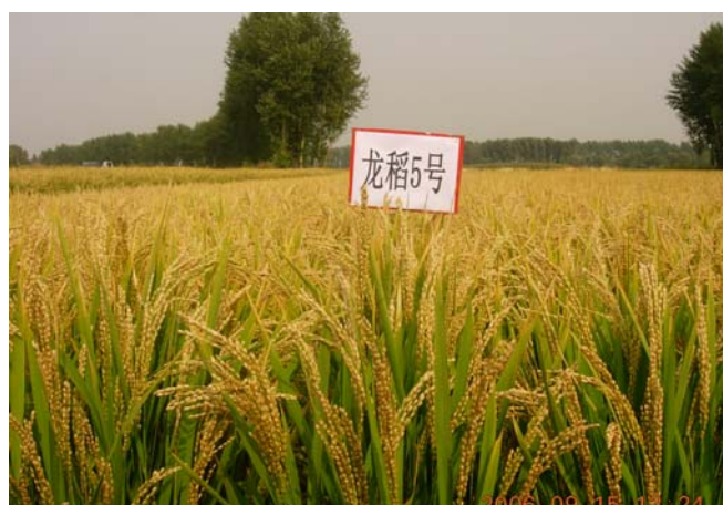
Figure 3 Cold tolerant variety Longdao 5 developed in Heilongjiang Province. Note the erect panicle display.

All researchers agreed to keep others informed of their work with follow-up liaison between Australian and Chinese researchers to occur in 2007.