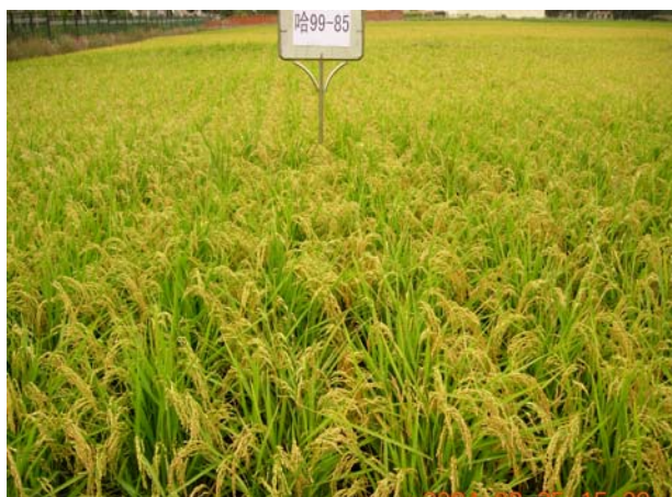
Figure 2. Field plot of the cold tolerant variety Longdao 4 developed in Heilongjiang Province.

The advantage of Jyoudeki over Hitomebore, the most common variety in Miyagi Prefecture, was reported as a reduction in cold-induced spikelet sterility from 18% to 7%, coupled with a slight reduction in plant height and maturity and high yield potential. Varieties such as these are likely to provide useful genetic resources for the Australian rice breeding program when combined with adaptation to Australian rice production environment.