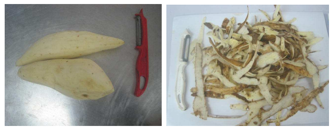
Figure 4. Vegetable peeler used in the experiments

constraint, a potato peeler (Figure 5) was recommended due to its lower waste rates. This particular peeler was tested in the experiments, and showed much better results in terms of the percentage of peel waste. Between 1.30 min and 3.20 min was required to peel one kilo of sweetpotato by one person, depending on the sizes.