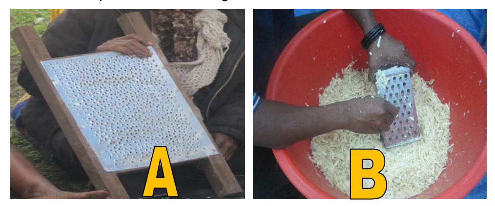
Figure 6. Hand-made grater (A) and multi-purpose slicer (B) used in the experiments

In this experiment, chipping was completed manually using home-made graters and multipurpose vegetable slicers. The two techniques tested are illustrated in Figure 6 below. On average, 24 kg of chips can be produced from the grater and 30kg of chips can be produced from the multi-purpose slicer for the same amount of time. Moreover, the home-made grater resulted in more sweetpotato off-cuts being discarded.