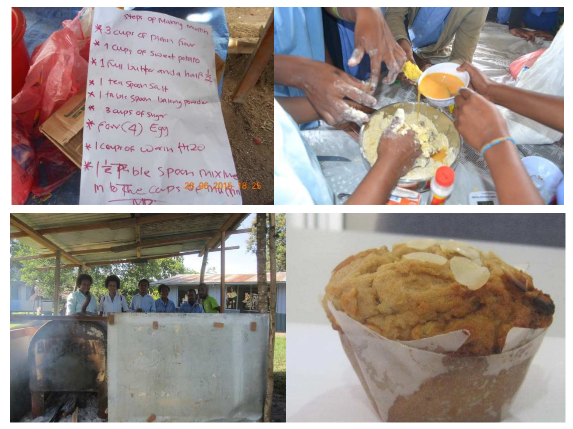
Figure 11. Process and samples of muffins using composite flour at the Bubia Primary School

Initially, the project assisted students to meet the cost of the ingredients, but students were later encouraged to bring their own baking ingredients and supplies where possible, including firewood, dishes, baking trays, spoon and cups. Some students illustrated their resourcefulness by borrowing basic baking utensils from families in the school compound and/or surrounding communities. How students learned to make muffins first time in their lives is shown in Figure 11.