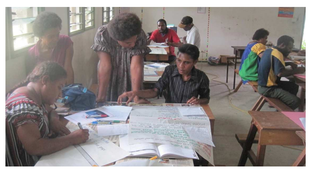
Figure 8. Teachers working in groups to develop the Unit of Work