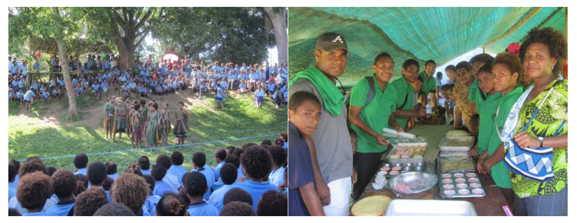
Figure 12. The Bubia Primary School Show and sweetpotato products on display

drawing, arts and cooking displays. The event was well attended by teachers, students and their families. Most food products at the cooking displays were sold out at the end of the day.