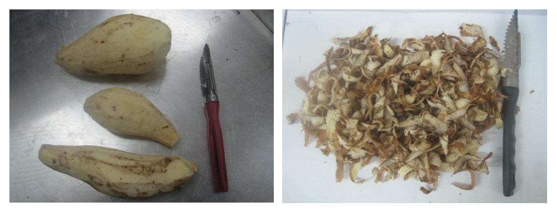
Figure 5. Potato peeler used in the experiments