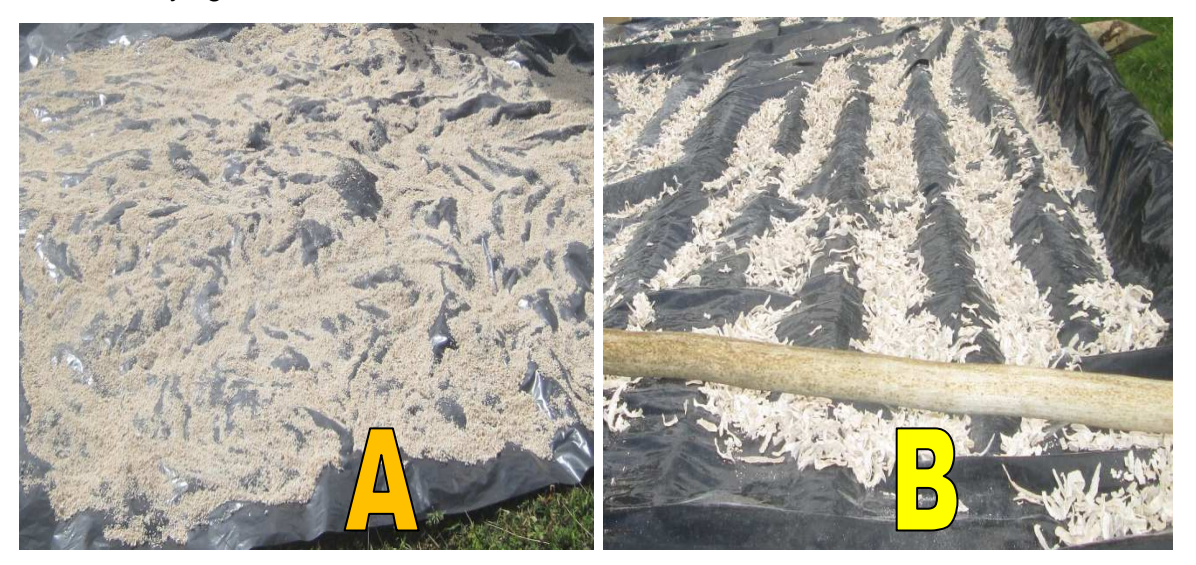
Figure 7. A – home-made grater and B - multi-purpose slicer

Chips produced by grating peeled and non-peeled sweetpotato roots, as well as those prepared by slicing, were tested in the drying experiments. Chips were also tested by oven drying (at the NARI Biotech Lab) to compare with sun-drying results. Chips were spread in a single layer on the drying racks for sun-drying and oven-drying tests (Figure 7). The results from sun-drying are shown in Table 12.