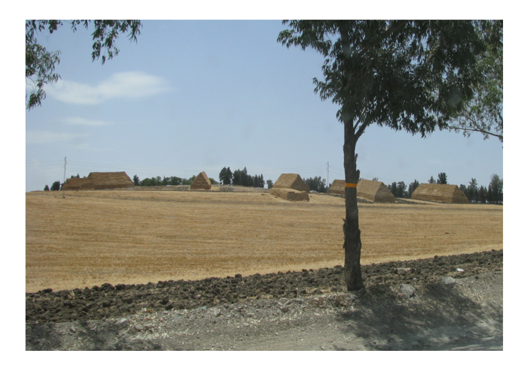
Plate 4 : Straw is a very significant market for livestock feed and realistic pathways for adoption of conservation agriculture practices must be integrated into livestock-cropping system.

Plate 3: Kuhn Zero-till Seeder imported by Comicom (Morocco)