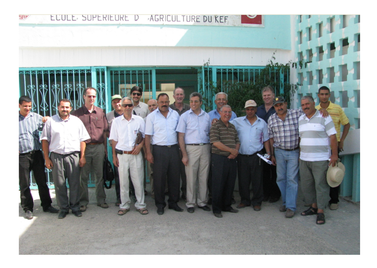
Plate 5: Group photo during visit with CA project staff at ESAK, Tunisia