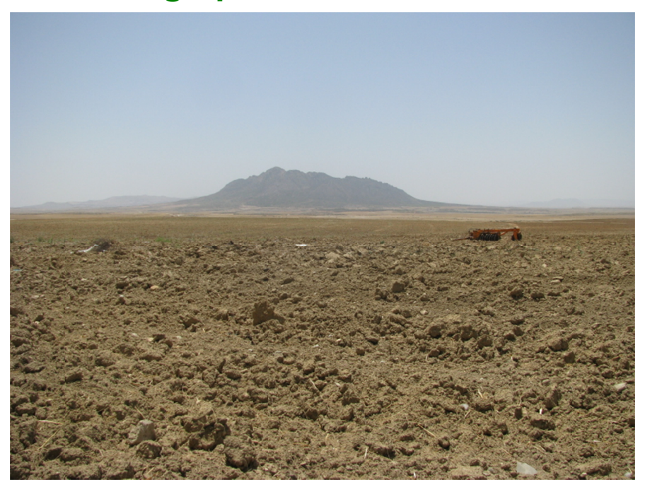
Plate 1: Conventional practices (ploughing and disc harrowing) in the region of El-Kef, NW Tunisia. Key incentives to no-till adoption in Tunisia and elsewhere have been erosion control on slopes, improved trafficability in higher rainfall and clay soil areas, and improved economics in the plains