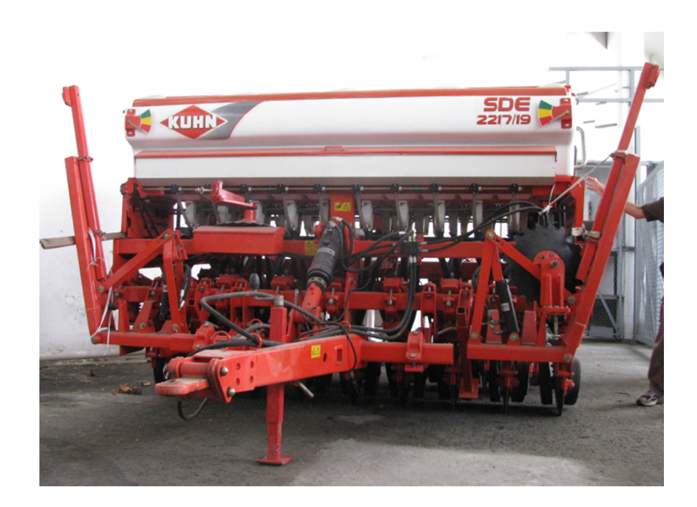
Plate 3: Kuhn Zero-till Seeder imported by Comicom (Morocco)