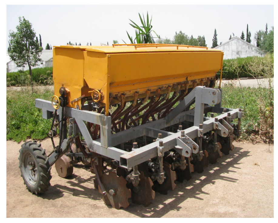
Plate 2 INRA designed (CRRA Settat) ZT drill unit manufactured in collaboration with Atmar. 32 units have been made to date (An equivalent unit was separately developed by the Agro-equipment and Energy Department at IAV II)

Plate 1: Conventional practices (ploughing and disc harrowing) in the region of El-Kef, NW Tunisia. Key incentives to no-till adoption in Tunisia and elsewhere have been erosion control on slopes, improved trafficability in higher rainfall and clay soil areas, and improved economics in the plains