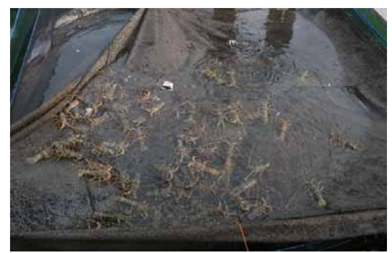
Figure 30: Market size Pasir, P. homarus ready for harvest

Growth rates, for 2cm juvenile to market size (Figure 30) were declared to be in the order of 6 months for pasir to 200g, and 8 months for mutiara to 350g, although with considerable variation in accounts. It was apparent that pasir initially grows faster than mutiara, perhaps through to 100g, but then the mutiara growth rate increases while that of pasir slows.