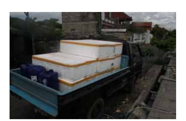
Figure 15: Transport to packing facility