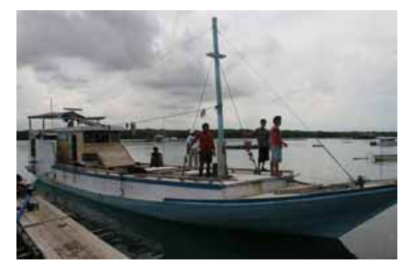
Figure 13: Lobster fishing boat

There appears to be generally three steps in the supply. Fishermen or lobster farmer, one (but sometimes more) middlemen involved in supply chain through to exporter. Profit margin at each step is very low, possibly as low as $US1 per kg, according to exporters.