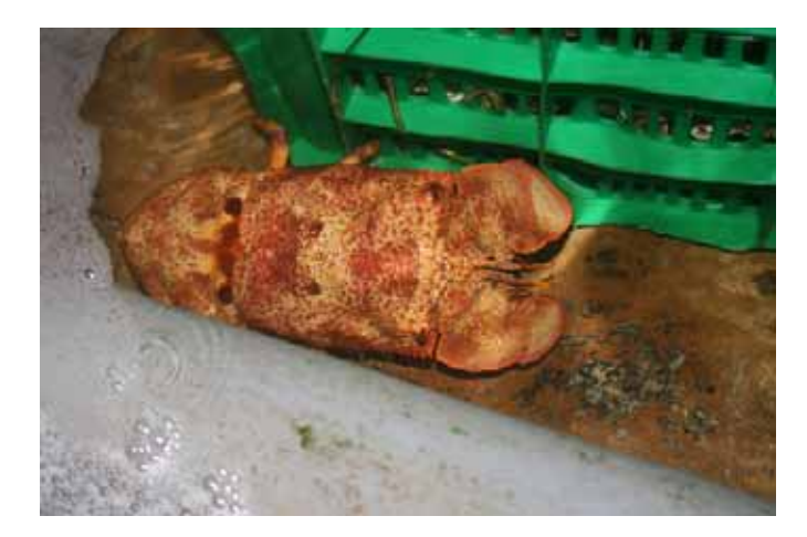
Figure 5: Red slipper lobster, Kipas mera, Scyllarides squammosus