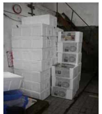
Figure 12: Export airfreight boxes. 12kg box for Taiwan (right) & 20kg box for China (left)