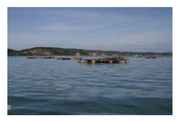
Figure 22: Simple cage raft