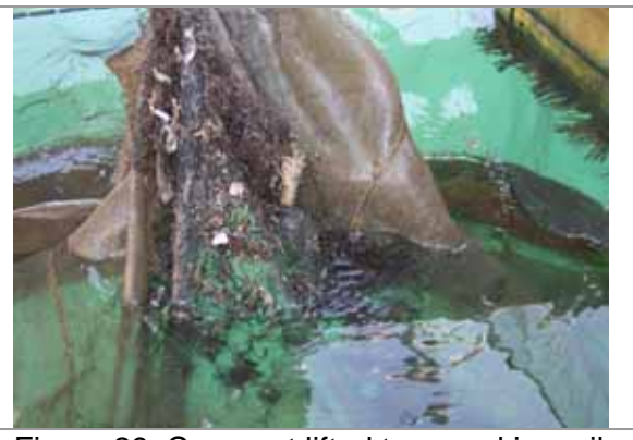
Figure 29: Cage net lifted to reveal juvenile lobster

Although the growout phase should be the most stable, there were varying accounts of survival from the various people interviewed, from very high (>90%) to quite poor (< 50%). The proven track record of lobster growout suggests that growout survival consistently above 90% should be achievable with improved husbandry and nutrition.