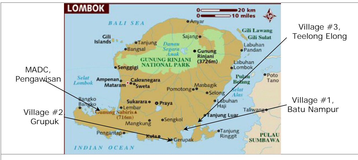
Figure 2: Lombok Island in Nusa Tenggarra Barat (NTB), showing location of villages in the southeast, where lobster aquaculture is developed, and the Marine Aquaculture Development Centre (MADC) in the southwest.