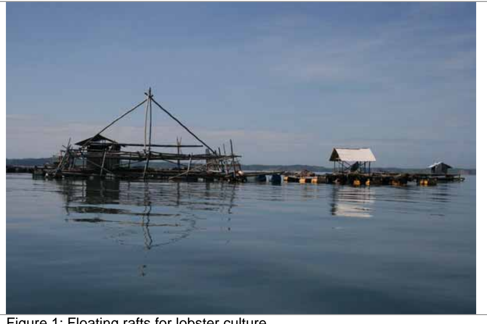
Figure 1: Floating rafts for lobster culture

The cage specifications and method of culture are simple and effective (Figure 1), and very similar to that of Vietnam where a very successful lobster aquaculture industry is well established. Cages are made from synthetic mesh (fish net) of mesh size up to 15mm, in cubic shape from 3.5m<sup>3</sup> to 64m<sup>3</sup> and suspended from a floating frame supported on plastic or steel drum floats.