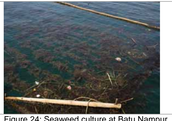
Figure 24: Seaweed culture at Batu Nampur

Some seaweed may be placed in the cages to provide refuge (Figure 24), although it is unlikely to be very effective, and indeed may be consumed by the lobsters. Its effectiveness, if any, would be most significant for the puerulus to juvenile phase. Shading over the cages was common, provided through palm frond thatch or synthetic shadecloth material.