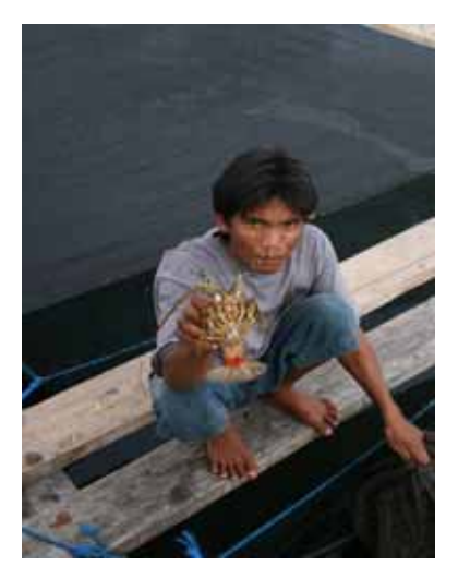
Figure 17: Market size Pasir, P. homarus with eggs, indicating maturity

The species available is fortuitous, as they represent two of the more valuable lobsters for marketing. Availability of the two species was in the proportion of approximately 3 to 1, in favour of pasir. The proportion may vary from one location to another, but pasir is the more abundant throughout the areas visited.