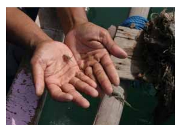
Figure 28: Puerulus (centre) & pigmented juveniles

Although the growout phase should be the most stable, there were varying accounts of survival from the various people interviewed, from very high (>90%) to quite poor (< 50%). The proven track record of lobster growout suggests that growout survival consistently above 90% should be achievable with improved husbandry and nutrition.