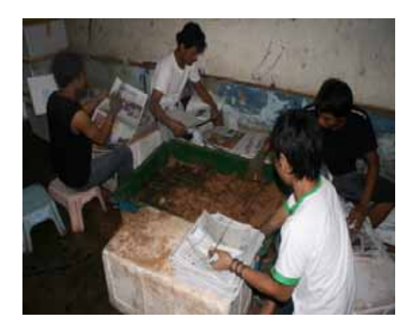
Figure 11: Rolling lobsters in wood shavings

Turn around time for lobsters in the facility is a maximum of 2 days, that is every lobster will be packed and shipped (or otherwise sold) within 2 days of arrival. Lobsters of particular species and size grade are weighed in lots appropriate to the packing box (standard styrofoam fish box). For Taiwan the box holds approximately 12 to 13kg of product, while for Hong Kong and China, a 20kg box is used. Boxes are individually numbered and the details of its contents are recorded on a manifest. The lobsters are then rolled in wood shavings (to retain moisture) (Figure 11) and individually wrapped in newspaper, before placing in the box (Figure 12). To assist in maintaining a cool internal temperature in each box, frozen 500ml bottles of water are also placed in each box; two to a 12kg box and 4 to a 20kg box. Once all lobsters have been stacked in the box, its lid is secured with masking tape, and a shipping label applied. Approximately 25 people work at each facility to process up to 1.5 tonnes per day. The facilities also handle some other products including fingerling fish (milk fish) and live groupers.