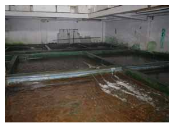
Figure 9: Holding tanks