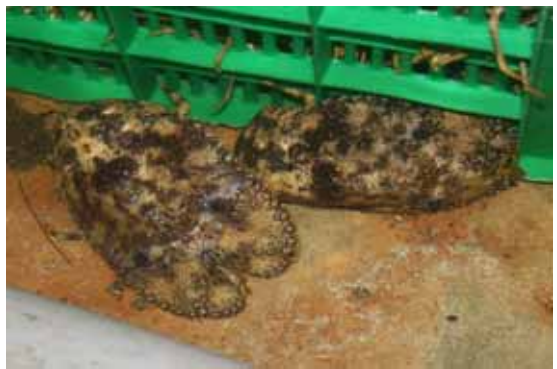
Figure 6: Black slipper lobster, Parribacus antarcticus