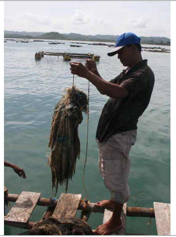
Figure 21: Puerulus shelter trap, suspended off raft

Availability of pueruli is seasonal and there appears to be a peak in catch rate during November and December. This is in accordance with Vietnam puerulus seasonality but in contrast with Australia for which peak recruitment occurs in July to September. This suggests that the source of seed, that is the breeding stock generating the larvae, is located north of Indonesia where summer breeding occurs around June and July.