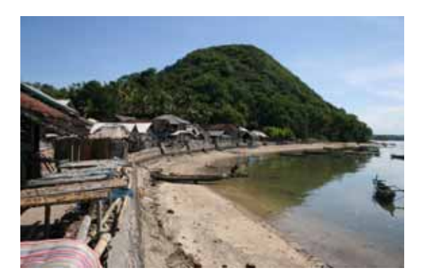
Figure 19: Village of Batu Nampur

For puerulus many are collected as a by-product of a light trap used for catching fish (Figure 20). These traps, known as bagang, are common along the coastline and consist of a bamboo frame structure secured to the sea floor by posts or moorings, and supporting a rectangular net which is lowered by rope to the sea floor. They are deployed at night, and a lamp is lit over the trap to attract fish. The lamp may be powered by kerosene, oil or electricity supplied from a small petrol generator. The trap is raised 4 times through the night to retrieve fish, and puerulus are often caught as well. Many of the fish are for direct human consumption, but the trash fish are all used for feed for the lobster (and grouper) aquaculture. Now that lobster aquaculture is developing, there is more attention paid to finding puerulus within the bagang catch, although it is apparent that villagers in many areas where the bagang is used are not involved in aquaculture and not aware of the puerulus. This latent capacity could be developed very quickly.