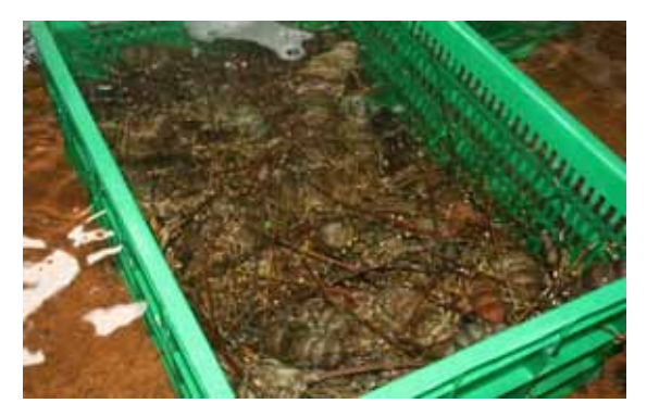
Figure 7: Pasir, P. homarus, sand lobster