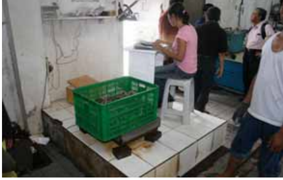
Figure 16: Weighing sorted lobsters prior to packing