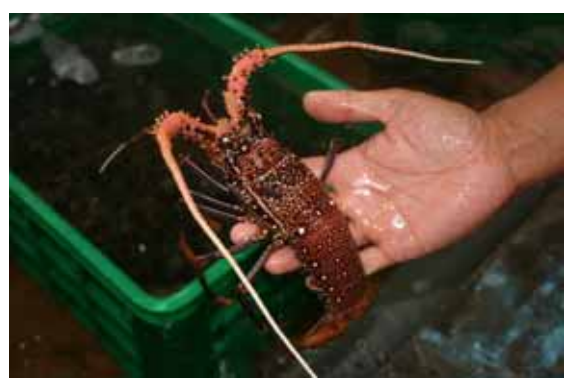
Figure 8: Batik lobster, P. longipes