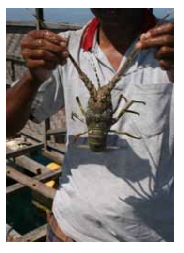
Figure 18: Pasir P. homarus at 300g