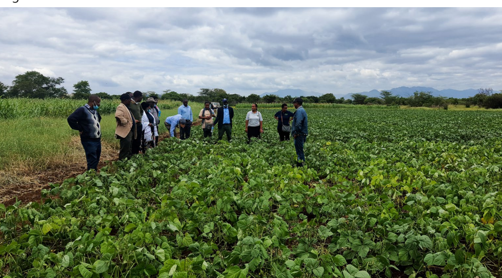
Multi-location trial inspection by TARI research team and project partners