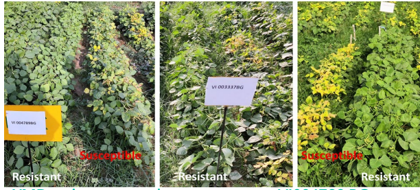
YMD resistant mungbean genotypes: VI004789 BG, VI003337 BG and VI004145 B-BLM

The identified new sources of YMD resistance will be used as donors in introgression breeding programme for developing superior mungbean cultivars. These could also be used for broadening the genetic base for resistance to YMD and for development of mapping populations to map genomic regions conferring resistance to MYMIV.