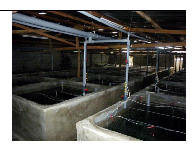
Figure 2. Concrete tanks used for lobster production.