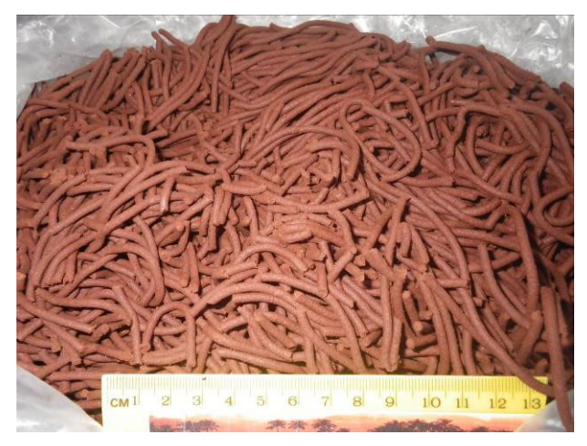
Figure 4. Moist pellet manufactured in the laboratory for the tank experiment.

the spaghetti-like noodles set overnight in a refrigerator. The noodles were reduced in length and held at -20°C until required.