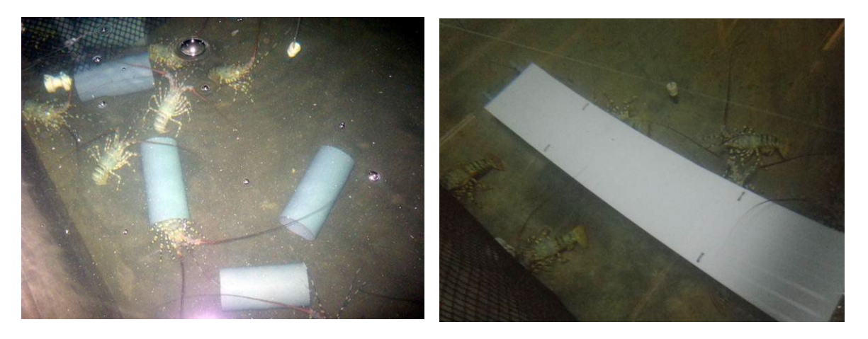
Figure 3. Photos of the two shelter types employed. PVC pipe shelters on the left and acrylic table shelter on the right.

The shelter treatments consisted of i) on-bottom pipe shelters using PVC pipes and ii) offbottom table shelters consisting of acrylic sheet supported on legs. The on-bottom pipes had a diameter of 40, 60 and 90 mm for the stages 1, 2 and 3, respectively. The offbottom table shelters were held above the tank bottom a distance of 40, 60 and 90 mm for stages 1, 2 and 3, respectively (Figure 3).