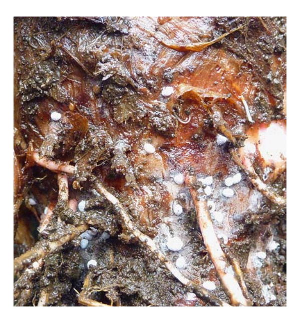
b) close-up of corm showing mealybug ( Paraputo sp.) infestation

a) mealybug-infested corms (left) are smaller and often mis-shapen