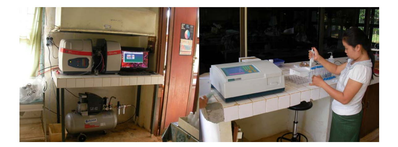
Figure 1: Installed AAS (left) and new spectrophotometer in operation (right)

Senior staff should now be able to supervise the use of the newly-acquired equipment and the conduct of new protocols, but have been assured of on-going advice by E-mail should the need arise.