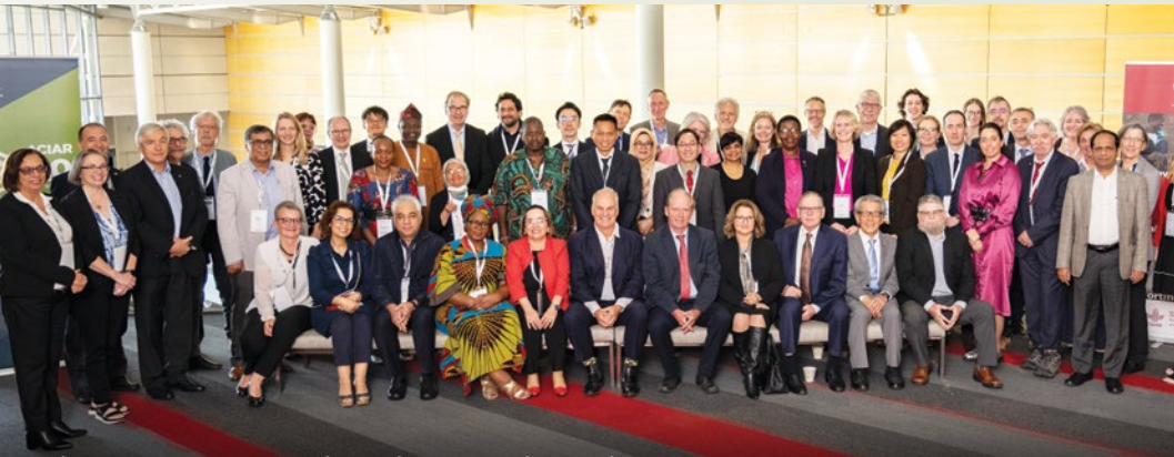
17th CGIAR System Council members in Brisbane.