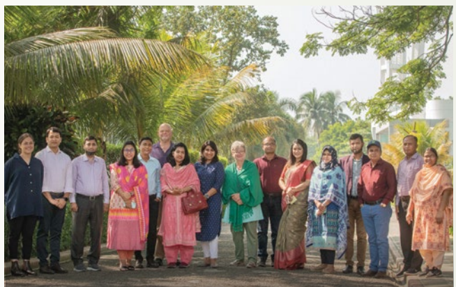
JDF Fellows gathered in Rajendrapur, Bangladesh.

Government Minister for Agriculture, Fisheries and Forestry, Senator the Hon Murray Watt and the Queensland Government Minister for Agricultural Industry Development and Fisheries, Mark Furner MP, welcomed the international delegates as part of the events.