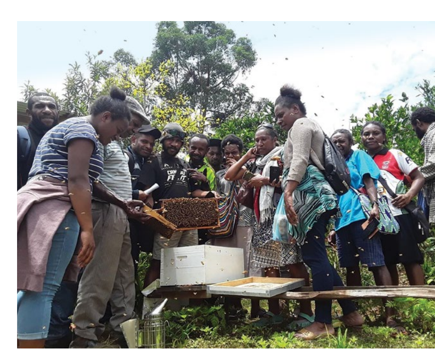
Local beekeepers take part in bee management workshops and experiments in Papua New Guinea.

identify and respond to threats. The costs and access to chemical treatments can also be prohibitive.