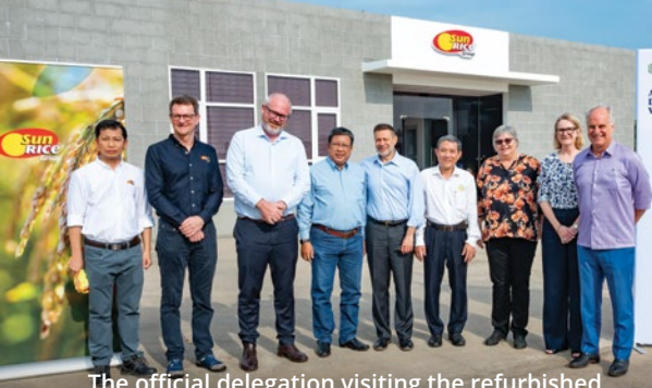
The official delegation visiting the refurbished SunRice Lap Vo rice mill in Dong Thap Province, Vietnam.