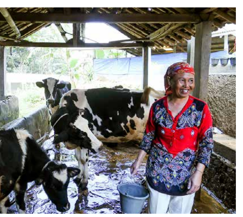
Dairy farmer in Indonesia. ACIAR project AGB/2012/099.

Fusarium wilt (tropical race 4) of bananas, also known as Panama disease, has become widespread throughout South-East Asia. The disease is threatening smallholder banana production in countries including Indonesia, the Philippines and more recently Laos. A new project aims to develop an integrated management response to the spread of the disease. Led by Dr Anthony Pattison of the Queensland Department of Agriculture and Fisheries, the project will investigate the effects on banana production of altering the banana microbiome to suppress disease and increase plant resistance to Fusarium wilt.<sup>22</sup>