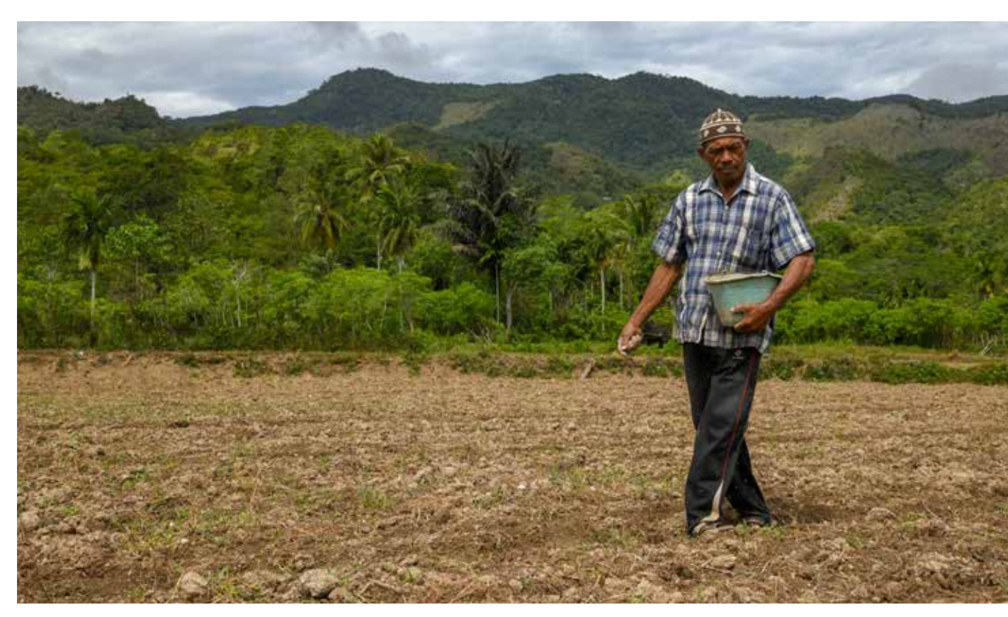
A farmer seeding a field in the dryland farming area of Aceh, Indonesia. ACIAR project ADP/2015/043.