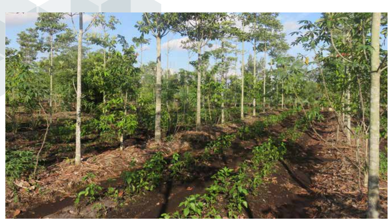
Peatland restoration project. ACIAR project FST/2016/144.

Regional collaboration in South-East Asia is urgently needed to reduce the risk of pest and disease incursion, and the impacts of established pests and diseases. A new project in 2019–20, with activities based in Indonesia, Vietnam and Laos, aims to implement best-practice forest biosecurity and pest management for sustainable productivity. With government and industry partners, the project led by Dr Caroline Mohammed of the University of Tasmania, will establish pilot forest surveillance networks, co-develop essential pest risk analyses and biosecurity plans, continue taxa screening and tree breeding that started in previous research projects for pest and disease tolerance and resistance, and examine silvicultural practices to reduce pest and disease spread and impact.<sup>20</sup>