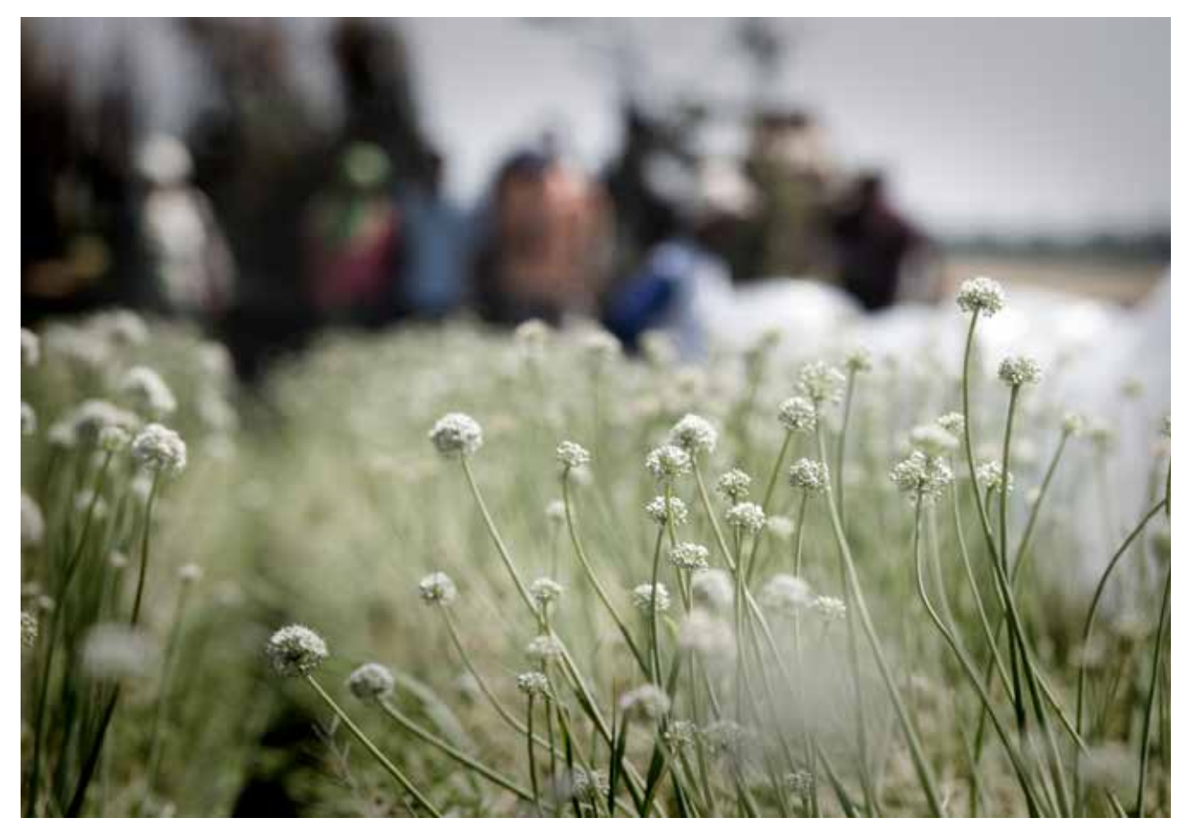
Shallots growing as part of a shallot-chilli-rice cropping system. ACIAR project SLAM/2018/145

ACIAR supports training activities delivered by the Crawford Fund. This includes the Master Class and Training Program, which is a key capacity-building program for international agricultural research-fordevelopment in the region. Participants include midcareer international scientists and young scholars.