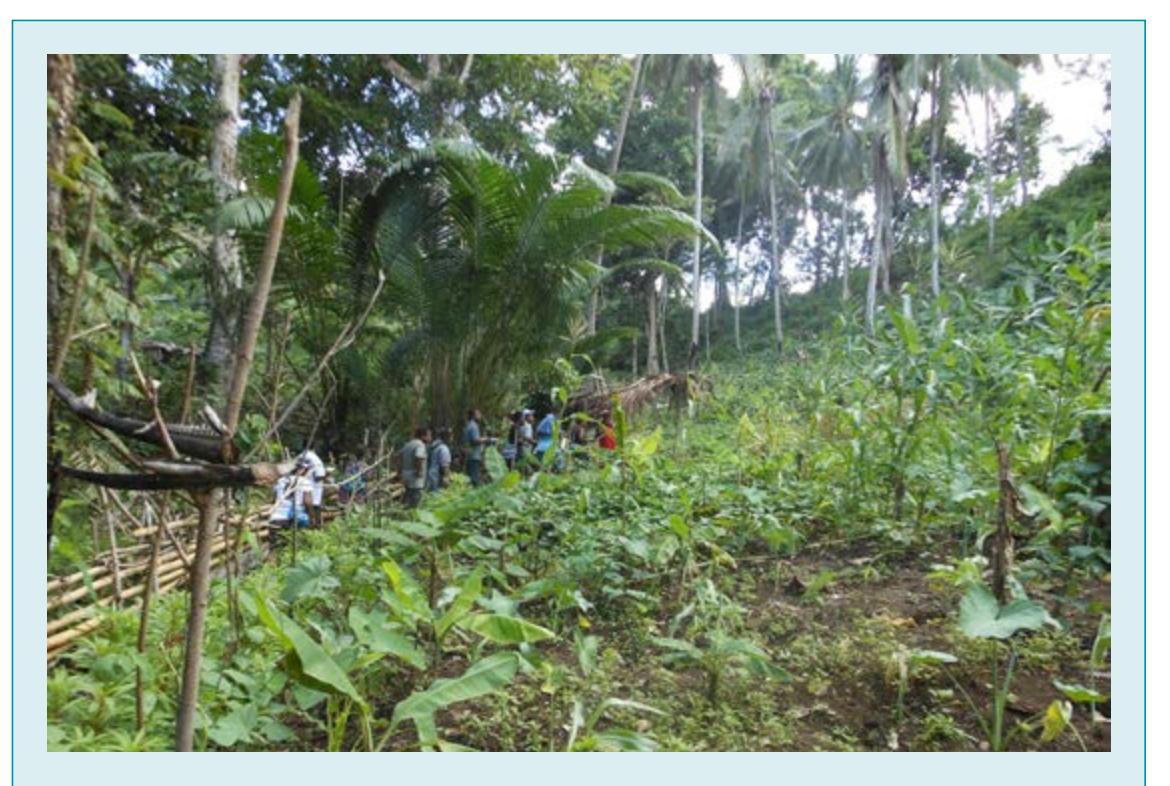
Visit to sweetpotato garden in Aronis village by project survey team

2 Sweetpotato varieties yielding well at high altitude will not usually yield well at low altitude, as low soil temperature is critical for storage root bulking.