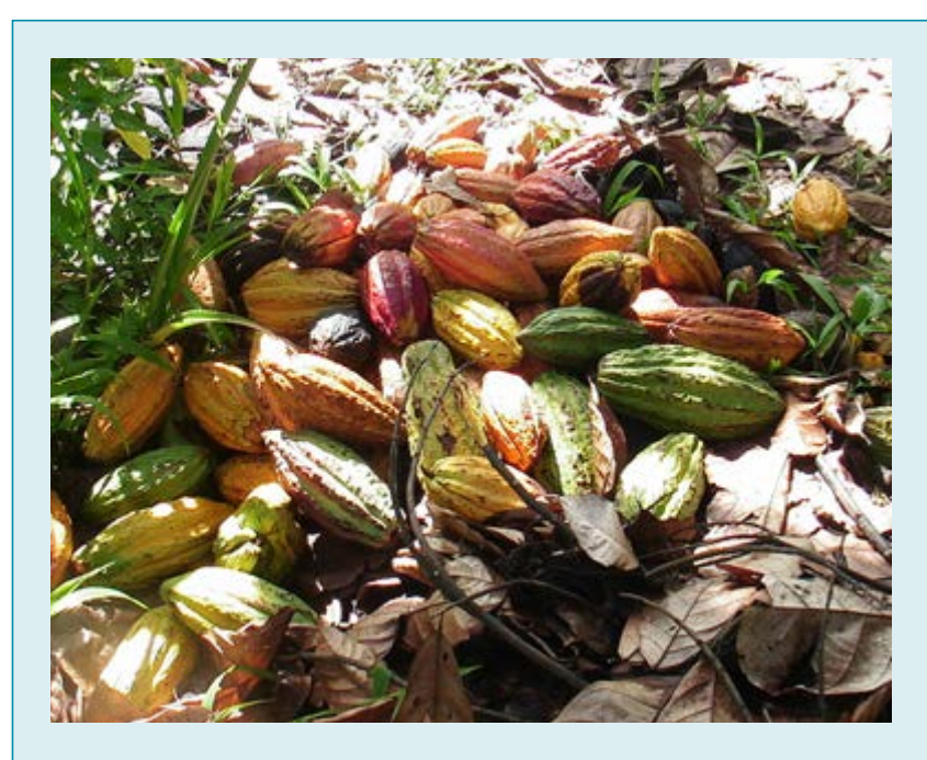
Cocoa pods freshly harvested from IPDM farmer Elmah Maxwell's farm near Arawa, Autonomous Region of Bougainville

In areas where CPB is present, no cocoa would be harvested without some sort of intervention. The regular pruning, harvesting and sanitation activities incorporated in IPDM level 2 management achieve excellent control of this pest.