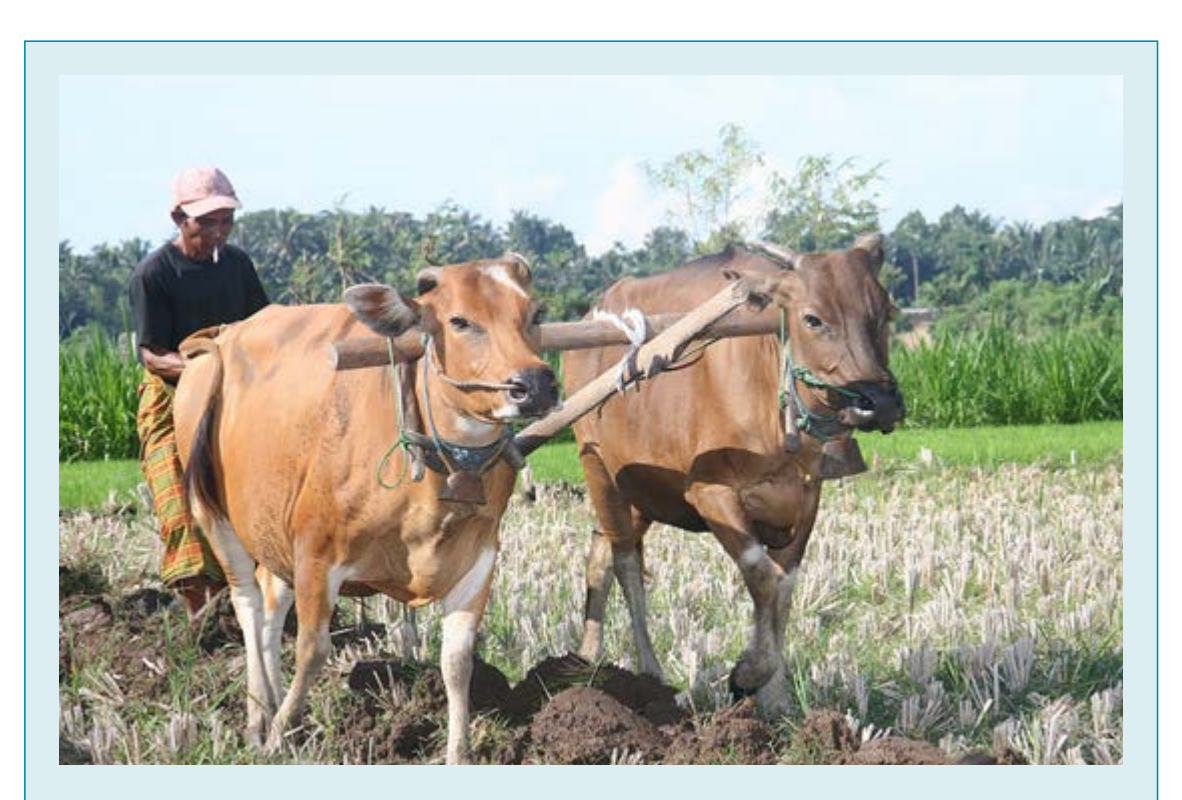
Traditional farming methods are used in conjunction with climate forecasts issued by the Indonesian Bureau of Meteorology (BMKG) to plan water allocations

CropOptimiser was developed to optimise regional cropping choices and patterns for different seasonal, climatic, agronomic and social conditions. It aids regional-level agricultural planning by providing cropping recommendations that can be disseminated through government officials and community leaders to the farm level. At the regional level, strategists can geographically optimise cropping choices and areas based on the likely water availability, as determined from climate forecasts and IQQM output. CropOptimiser uses a linear programming approach to maximise profit, subject to physical and social constraints for defined cropping seasons and climate forecasts. Regional inputs include available land area, soil types, rainfall and irrigation system diversion time-series data. Crop characteristics are defined by potential yield, water demand, a soil productivity index, growing costs and prices.