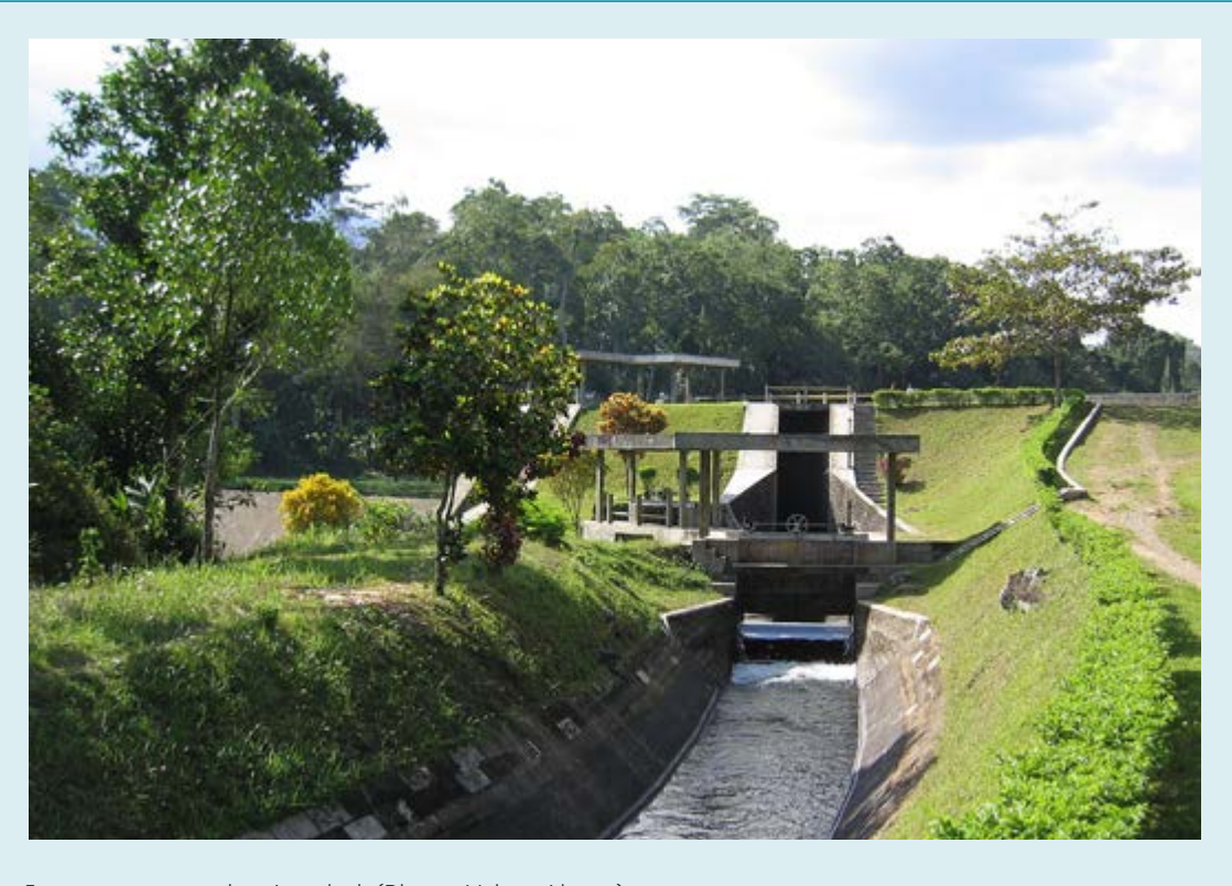
Irrigation network in Lombok

IQQM is a hydrological model used for planning and evaluating water resource-management policies at the river-basin scale. Used extensively in Australia, the IQQM was configured for the river systems in Lombok, covering an irrigation area of 64,000 ha from the Jangkok system in the north-west to Jerowaru in the south-east. The model was calibrated using limited observed daily irrigation diversion data to simulate at least 50 years of daily streamflow and irrigation diversions. The output from the IQQM is used in FlowCast and CropOptimiser to evaluate the impacts of climate on water allocation and cropping decisions.