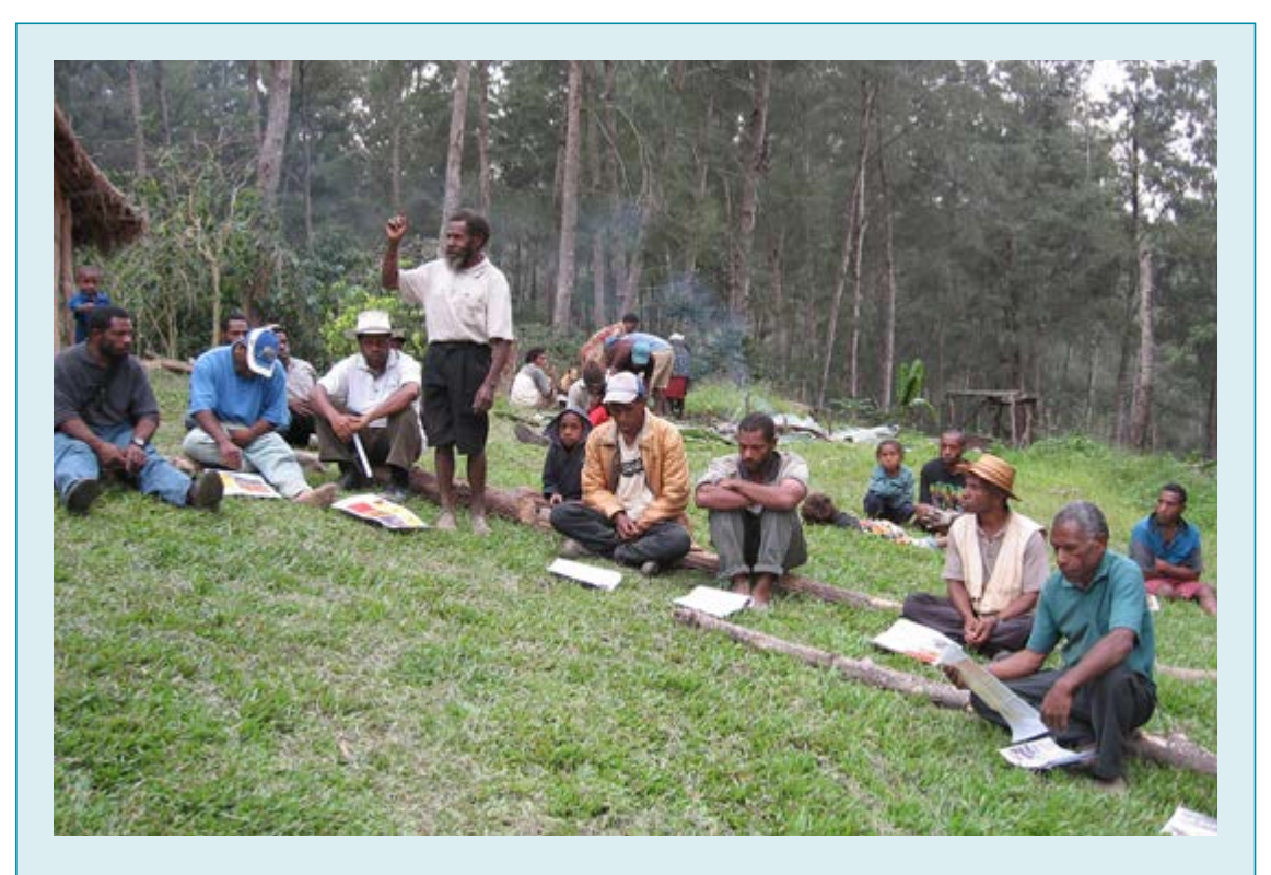
A participating group of coffee farmers in Chimbu province discusses the conversion rates from cherry to parchment