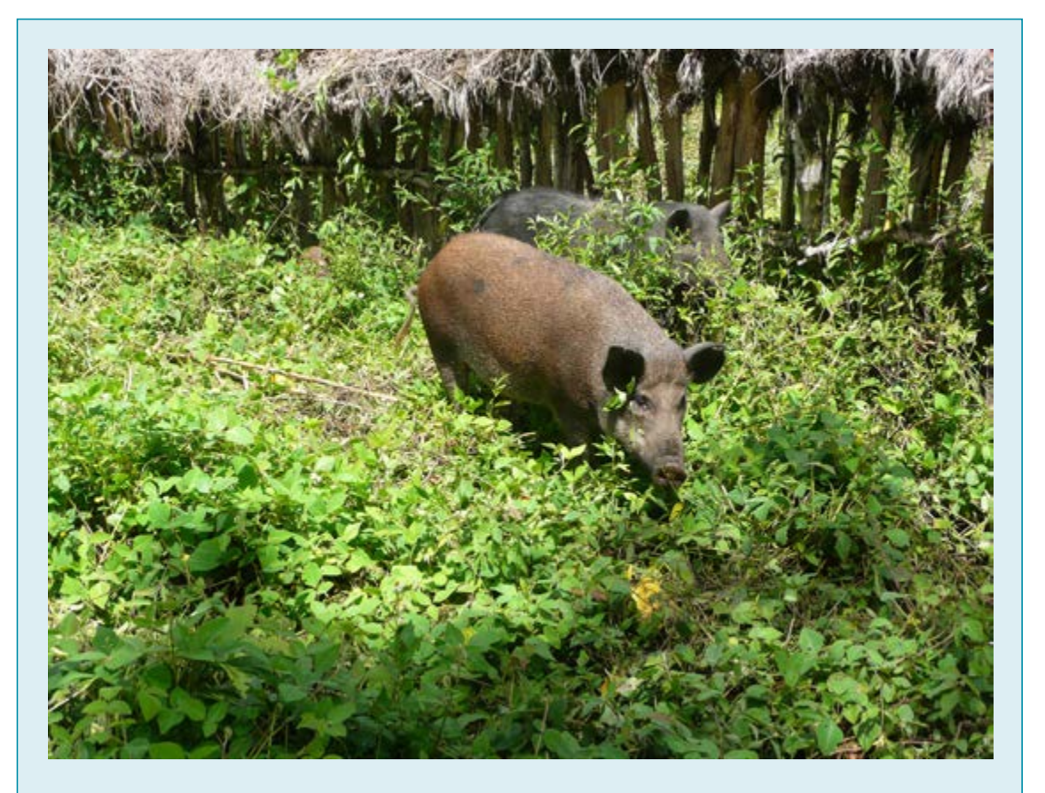
Pigs foraging high-protein pasture in a laleken (small fenced paddock)

2 AH/2007/106—Improvement and sustainability of sweetpotato-pig production systems to support livelihoods in highland Papua and West Papua, Indonesia