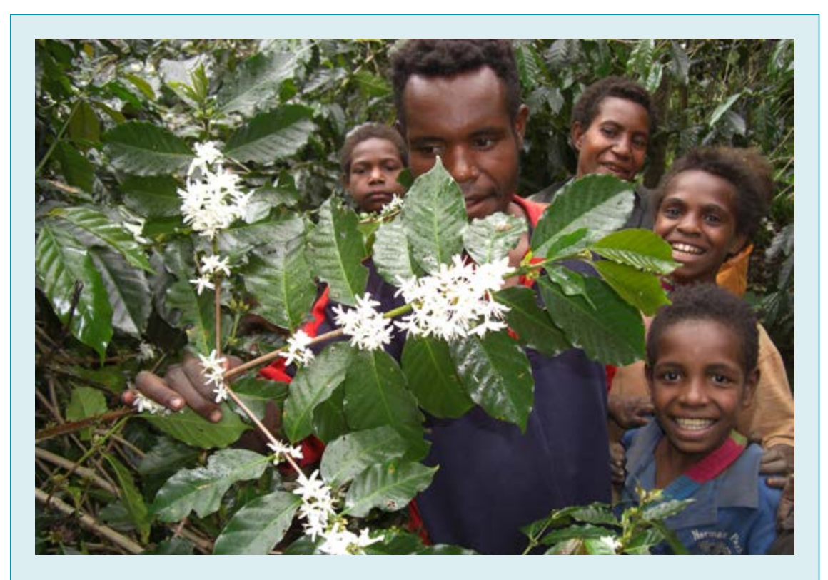
A family in Eastern Highlands province inspects coffee blossom—a sign of things to come

The smallholder sector generally produces fair average quality coffee (Y grade), which is consistently discounted against the New York 'C' price. The main complaint from buyers is inconsistency in quality from season to season and from shipment to shipment. In 2002, in response to market needs, the Coffee Industry Corporation (CIC) implemented an eight-point plan to improve the overall quality of PNG coffee. However, one of the major obstacles was the failure of the current marketing system to give the right price signals