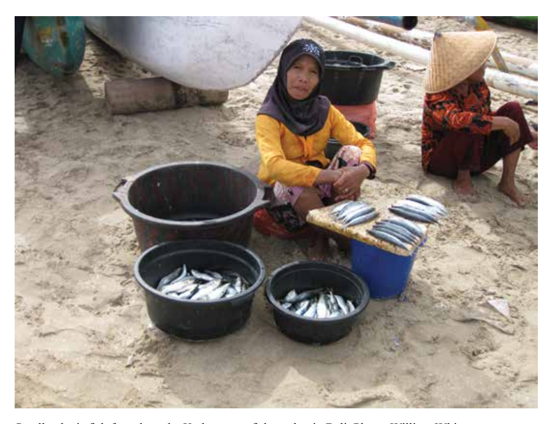
Small pelagic fish for sale at the Kedonganan fish market in Bali.