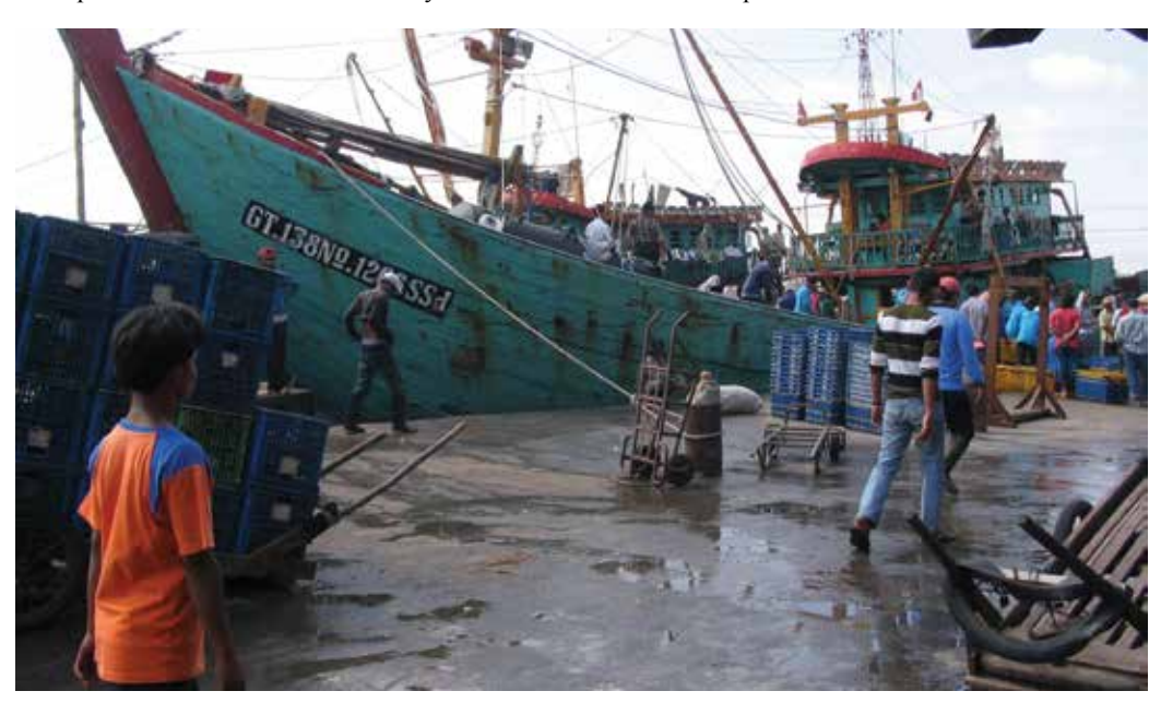
Catches being unloaded at the Muara Angke fishing port in Jakarta.

The plan builds on the capacity development framework Net Returns: A Human Capacity Development Framework for Marine Capture Fisheries Management in South East Asia (DAFF 2011a). This framework was developed under the RPOA IUU (2007) through a participatory approach involving the RPOA members. The RPOA IUU (2007) was a joint initiative of the Indonesian and Australian governments that 11 South-East Asian countries signed in 2007. The overall goal of the framework is to increase the capacity of people and institutions involved in marine capture fisheries within RPOA participating countries to develop their abilities, to ensure the sustainable development of the region's marine capture fisheries. This strategic plan used the framework and applied it across marine and freshwater capture fisheries in Indonesia.