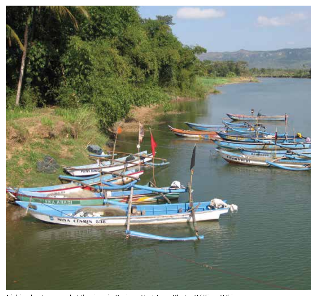
Fishing boats moored at the river in Pacitan, East Java.