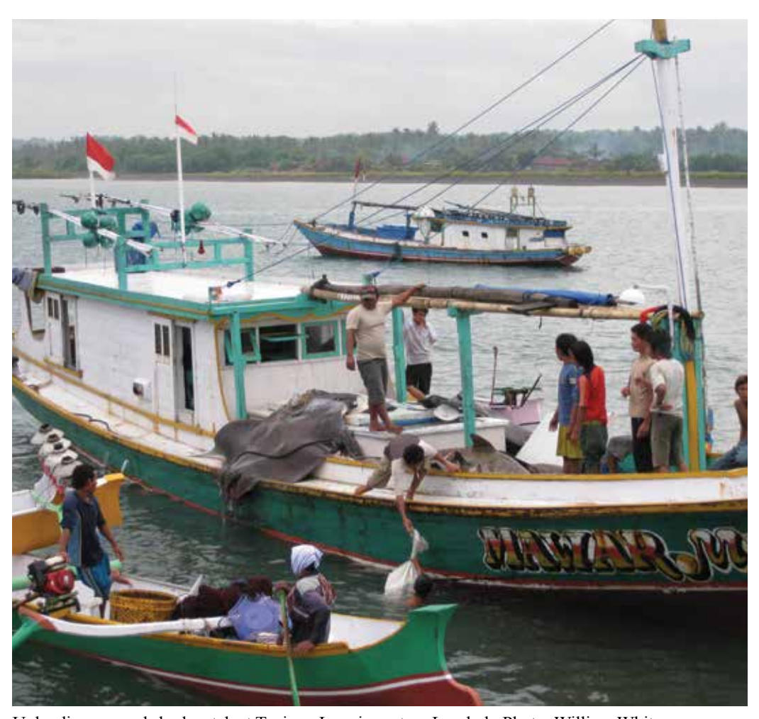
Unloading ray and shark catch at Tanjung Luar in eastern Lombok.