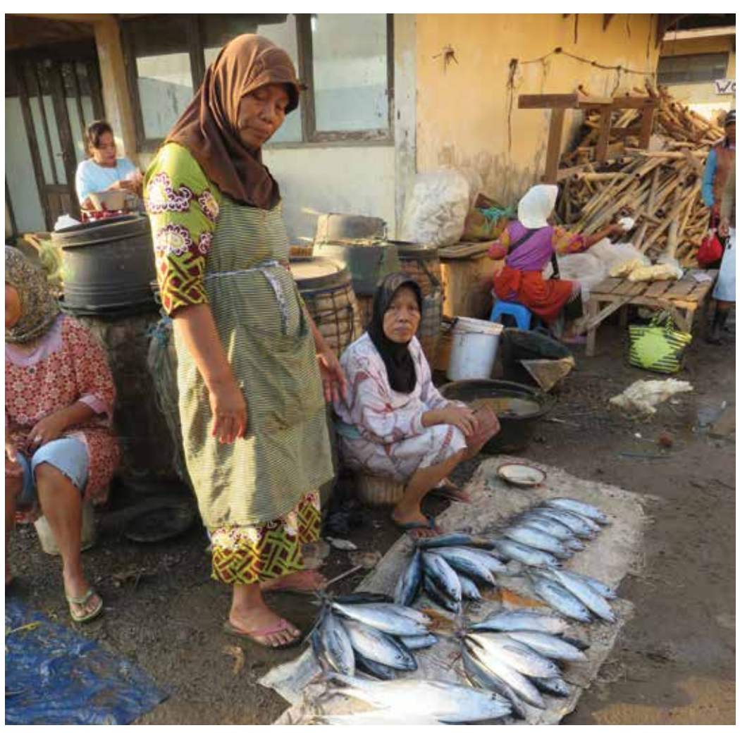
Women selling fish in the town of Jepara in Central Java.

limited engagement of women in stakeholder discussions, management efforts or policy development can result in lost opportunities to improve conservation practices and ensure secure, viable livelihoods. There was a clearly identified gap in understanding the role of women in fisheries and associated communities and also the need for capacity building to improve engagement with this stakeholder group. This is seen as a high priority to support improved policy, management and decision-making at national, provincial and district levels and in support of pursuing the Millennium Development Goals.