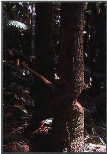
Felling a 'cabbage palm' at Tully, north Queensland, April 1961

the car, and felled a tall, slender 'cabbage palm', later determined as Archontophoenix alexandrae . It was exciting to find agonoxenid larvae feeding on it. This was a useful discovery which I took advantage of in a later visit.