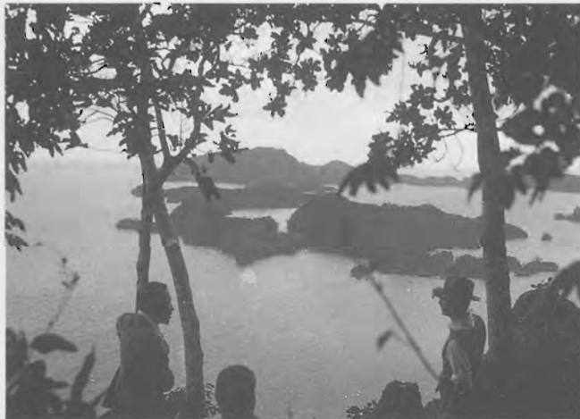
'Bay of islands', Nabaratu

Although so abundant at that time in Fiji, the BM [British