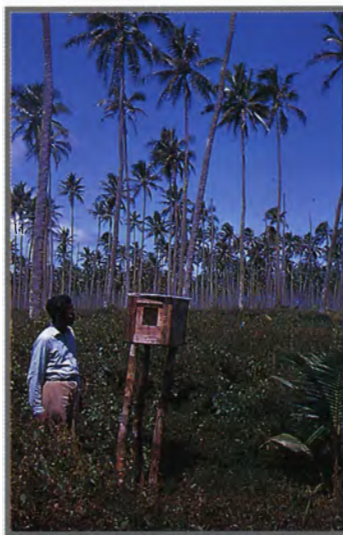
Tachinid release site in Fiji

We sent 959 fly puparia to Fiji over a period of four-and-a-half months. O'Connor started to breed the parasite at Koronivia. It attacked Graeffea successfully and a generation was reared on that host, but later on he was unable to maintain a breeding stock, so