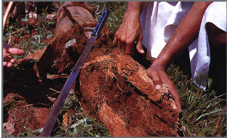
Oryctes oviposition chamber in coconut stump

Back at Colombo, Felix K. took me to a fibre mill where I paid the owner to fell two badly damaged coconut palms. The fronds of these were removed and laid out in their age order. Every one had rhinoceros beetle damage and five live adults were removed. In spite of this continual damage, the palm, over the previous two years, had produced 14 mature nuts. Other less damaged coconuts nearby had an average of 26 mature nuts. Thus, rhinoceros beetle could have reduced yield by as much as 50%. There was nearly always much damage to palms adjacent to fibre mills, but it was difficult to discover exactly where their grubs were breeding. No sex nematodes were found in Ceylon.