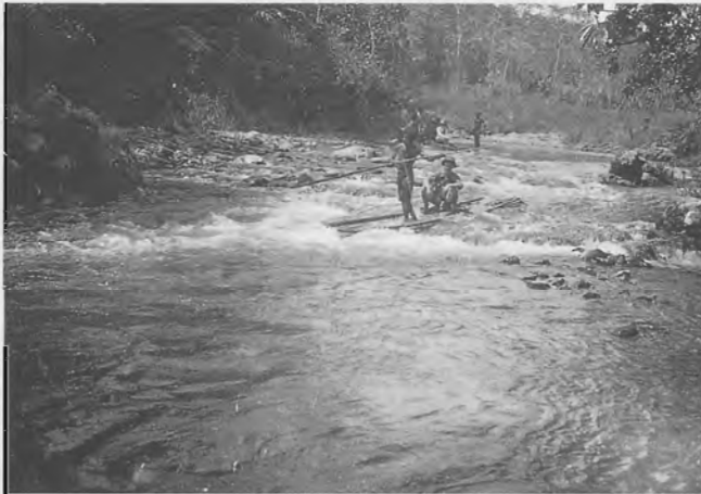
Emerging from the Waiga River rapids