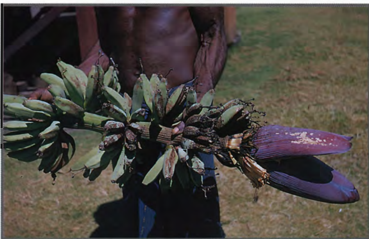
Scab moth damage to banana bunches

I flew on to Brisbane, where Veitch (late of the CSO, Lautoka) told me scab moth occurred in north Queensland, but wasn't a serious pest.