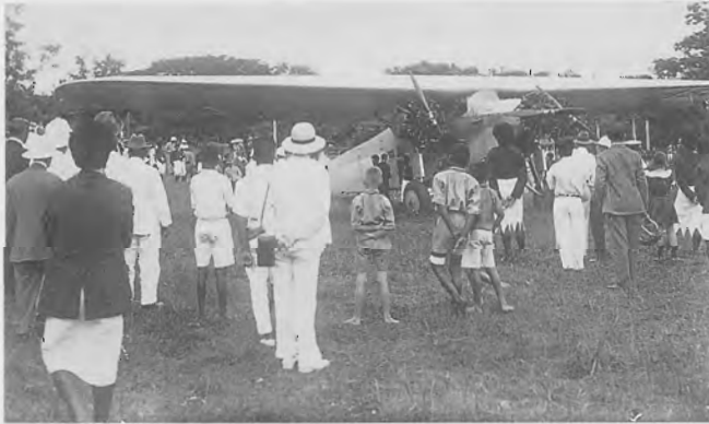
Charles Kingsford Smith's Southern Cross about to leave Suva in June 1928