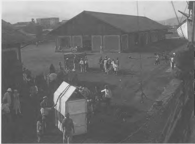
Unloading the cage in Fiji