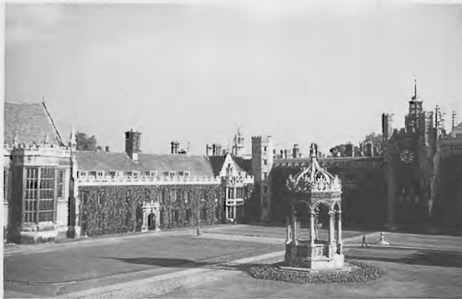
Trinity College, Cambridge

I sailed by the Montcalm from Liverpool. As things turned out it was inappropriately named