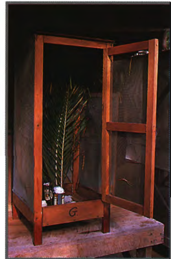
Phasmid storage cage

It was only after I had visited Kolombangara in the west of the group that our main