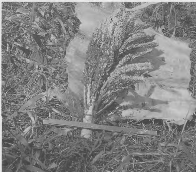
Coconut spike badly damaged by Tirathaba

I travelled overland to Genoa where I joined a Dutch ship