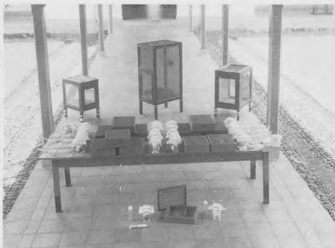
Breeding apparatus for Tirathaba

were rather large gecko lizards known as 'tokeis'. Every so often one heard their 'chuck, chuck ... chuck' in ever rising notes, until at its peak the animal seems to expire its breath in a series of 'tockeis', which after six or so, get fainter until the whole performance is over. These lizards usually hid themselves near the roof timbers and only occasionally could be seen. I