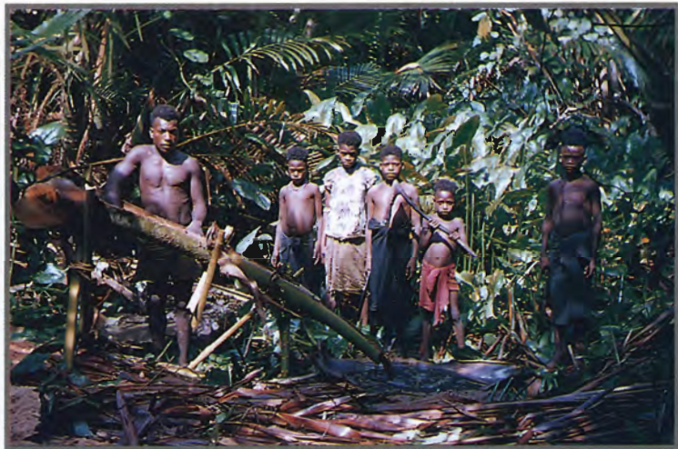
A family preparing sago, Umboi (Rook Island)