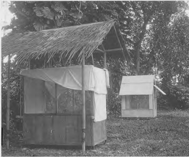
Erycia breeding cages