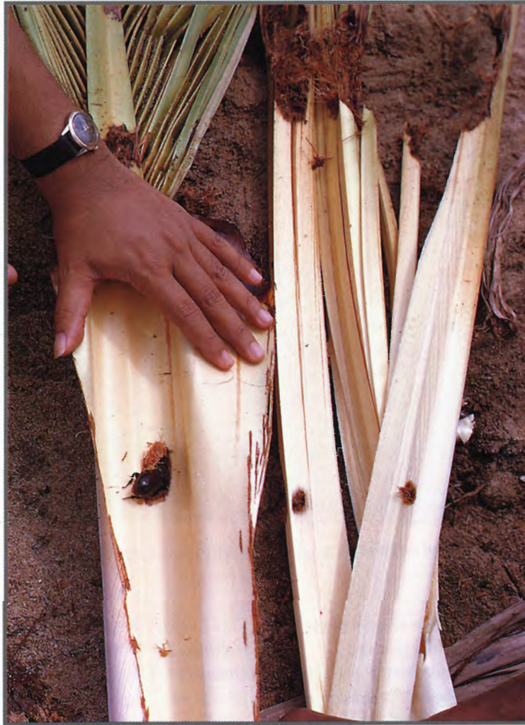
Oryctes rhinoceros boring its way into the heart of a coconut palm frond

My assignment for this rhinoceros beetle work involved me in more individual direction, with a degree of protocol attached. I was given letters to influential people and told the order in which they were to be seen. It was all very different from my work for Fiji and I found it quite exciting. The excitement was mainly due to Hoyt's discovery of a certain species of nematode in the sex organs of male and female Oryctes centaurus on sago palms in New Guinea. These most interesting nematodes did not occur in O. rhinoceros . This seemed to indicate that if I could discover a place where the latter contained this sexually confined thread worm it might be the place where the pest originated, and hopefully where it might be under control.