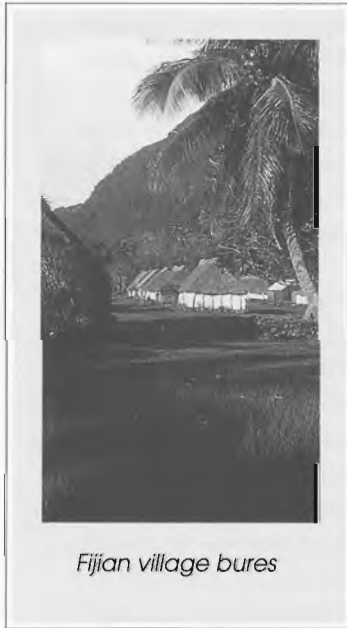
Fijian village bures

In September I took parasites to the north coast of Viti Levu. It was a relief to escape from all the social activities in Suva, where two New Zealand naval vessels were in port. After releasing Telenomus and Apanteles I walked up to Nandarivatu to spend a night in the cool. The next day I started to walk overland to