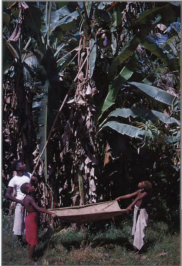
Collecting scab moth in New Britain