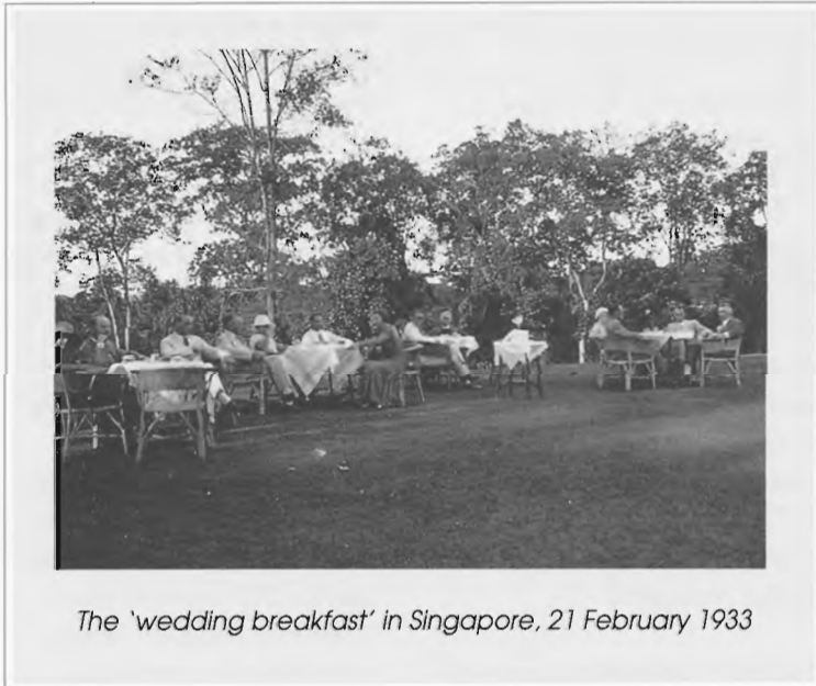
The 'wedding breakfast' in Singapore, 21 February 1933

Noel and I paid a last visit to the west coast for additional Tirathaba larvae. These would yield flies which could be used to infect host larvae during the early stage of the voyage. With the Taylors and their leaf-miner parasites we all