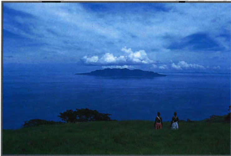
Savo Island, Solomons

collected at Suta, a place in the foothills of Popomanasiu, the highest mountain (8000 ft) on the island. Greenslade and I did an expedition there. It was very tough going and we had some excitement with rapidly flooding creeks, which sometimes separated us for a few hours until they subsided. After camping in the bush near Suta I found few signs of stick insects, so the five-day excursion provided little more for me than good exercise.