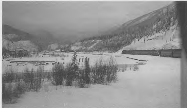
Across the Rockies by rail