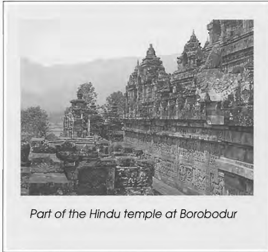
Part of the Hindu temple at Borobudur