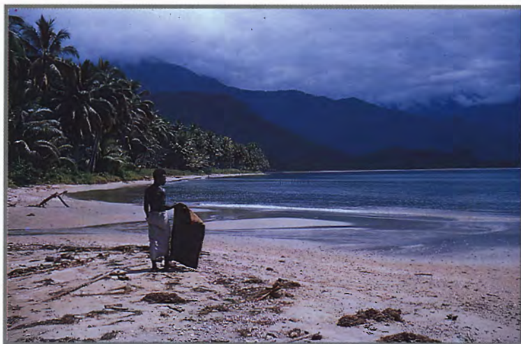
Bay to the west of Busama Village, near Lae

Fruit bats (flying foxes) robbed us of bananas and soursops growing in our garden. The natives wrap dead banana leaves round ripening banana bunches to protect them from these pests. But they also eat the bats and use their bones to make strong 'net' bags (billams).