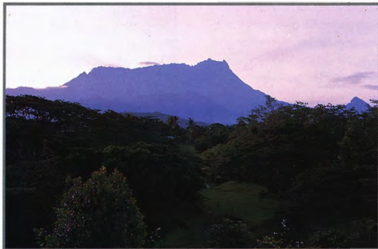
Mt Kinabalu, from the rest house at Kota Belud, Sabah

— here called 'gebanga'. It had a widish trunk, the outer inch of which has fibres like iron. One could cut off only small chips with an axe, but once through that perimeter layer the fibres were fairly soft and easily cut. It took two hours work to bring it down. As it had completed its single terminal flower it was moribund and already contained 70 rhinoceros beetle larvae in the top five feet.