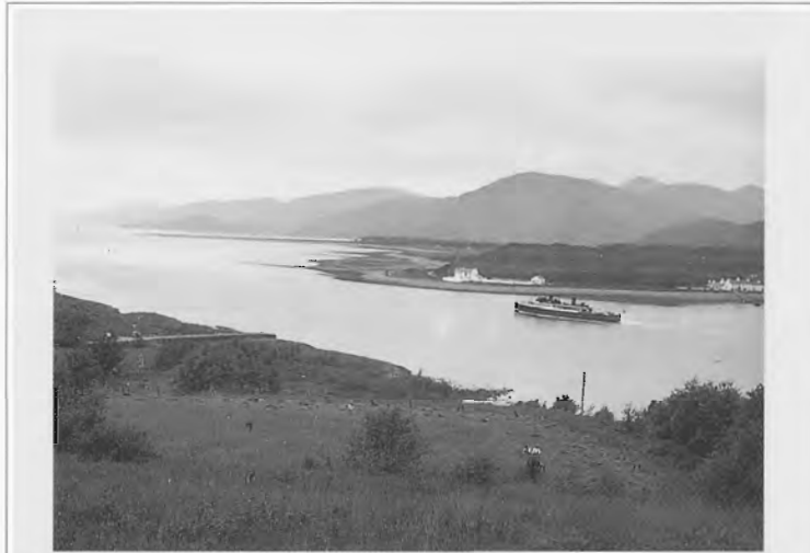
View from the future house site at Corran, with Loch Linnhe and the steamer to Oban in the background

Just as we had made all arrangements to start on our