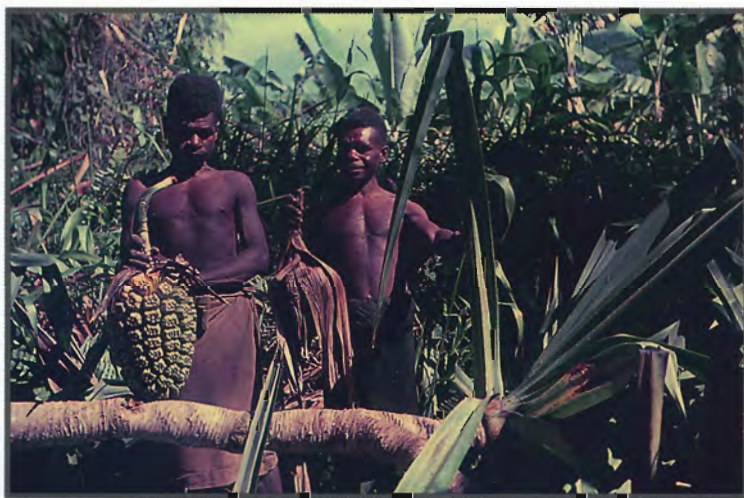
Fruit of Pandanus in which scab moth pupae were found

After returning to Lae, I began to collect N. octasema larvae from Pandanus flowers growing in fairly isolated groups up the Markham valley. From these I bred out the polyembryonic egg/larval parasite, later to be described by Eadie of the BM as