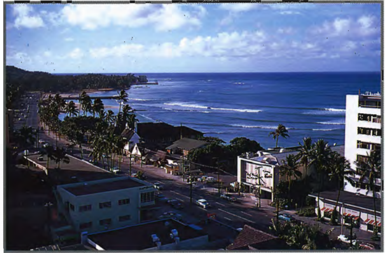
Waikiki from the Princess Kaiulani Hotel, Honolulu, October 1956