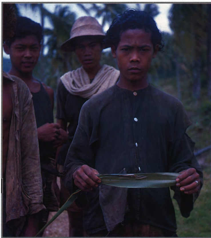
Young insect collectors near Tjilogon, Java, 1959