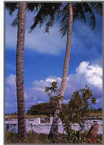
Feeding tunnels of Oryctes rhinoceros on a coconut palm trunk, Gan, Maldives