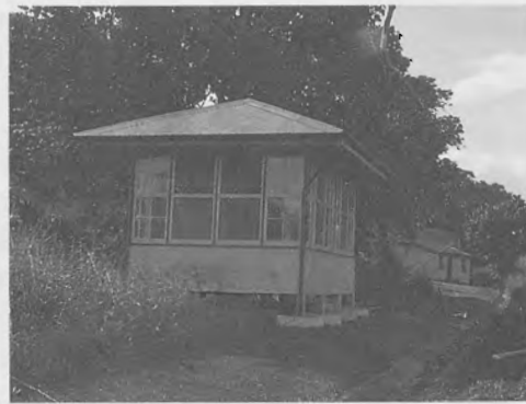
Insectary built for the 'Levuana Campaign'

On returning from Moturiki we put in at a very small, circular island, Leleuvia. The ship's dinghy was unable to reach the shore, so we were carried ashore on the shoulders of Fijians, who with their large feet and spreading toes, seemed unaffected by the rough surface of coral. Leleuvia had also suffered from the recent outbreak of the coconut moth. Between the palms there was a thicket of overgrown shrubs among which were the small hanging