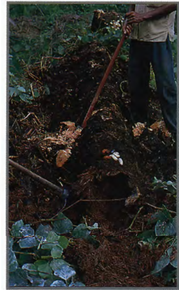
Oryctes rhinoceros grubs, pupae, and adult from oil palm logs, Kulai Estate, Johore, Malaysia, 1965

growing bud of the palm it will die. This was rather exceptional, but by chewing at the unformed leaves the latter open with scissor-like cuts through the leaflets to produce the tell-tale type of damage characteristic of this pest.