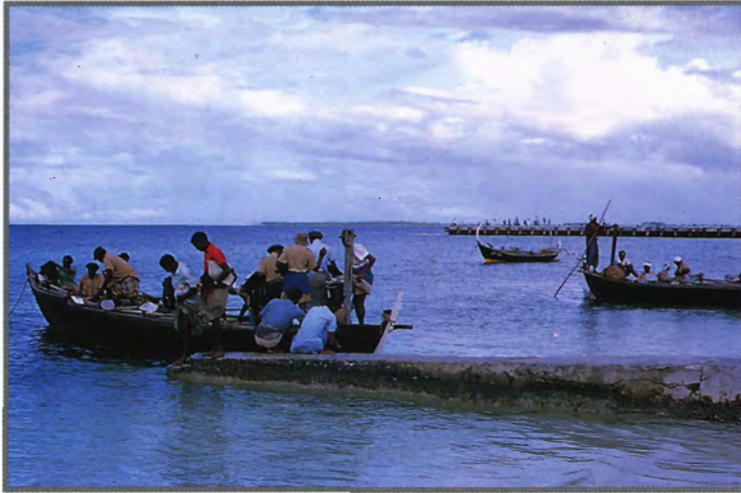
Maldivians embarking on dhoni at Gan

Gan, mostly cleared of coconut palms to make an RAF staging post, must have been a haven for rhinoceros beetle shortly afterwards. There was plenty of it still in the few remaining coconuts, but nothing of much import. I visited a neighbouring island, Hittadu, where there were coconuts in the small RAF transmission concession. Otherwise the island was closed to Europeans. I procured 30 rhinoceros beetles