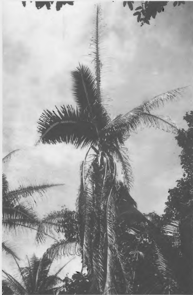
A coconut palm attacked by Levuana