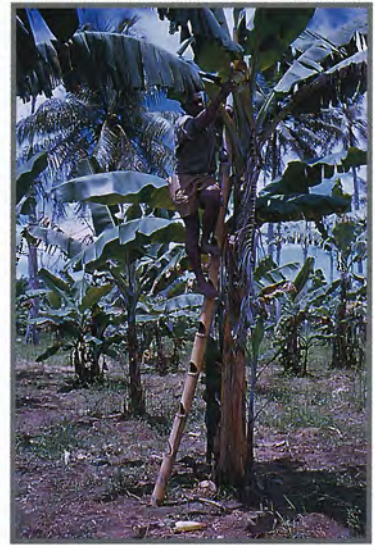
Method of dusting bananas for scab moth control, Navuso, Fiji

So to New Guinea I went. Before leaving Fiji I spent a few days on Taveuni. I was asked to check the effectiveness of metal bands on coconut trunks to prevent rats climbing up. Barney also wanted me to bring him a collection of eggs of Graeffea , the stick insect which caused much damage on certain estates.