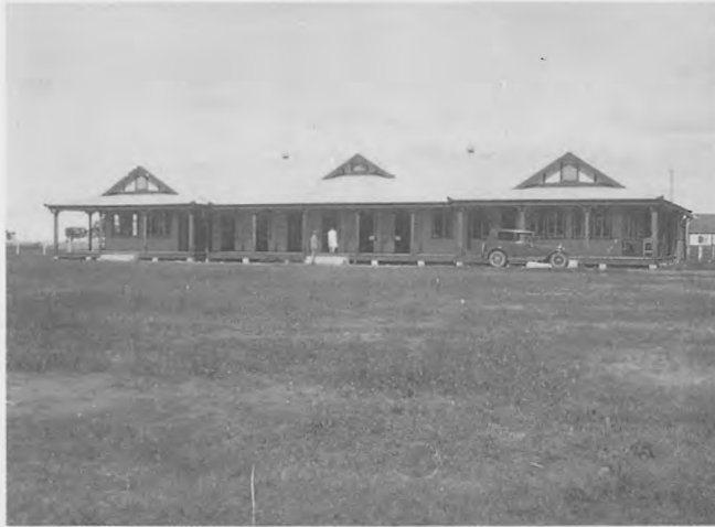
Agriculture Department building, Fiji

eastwards to threaten the main copra-producing islands. Copra, after sugar, was Fiji's most valuable export.