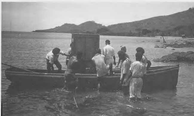
Landing cages of B. remota at Caboni

Museum (Natural History)] had very few specimens of Levuana . I mounted and sent several, but they were still poorly represented, rather unfortunate in view of the later extinction of this species.