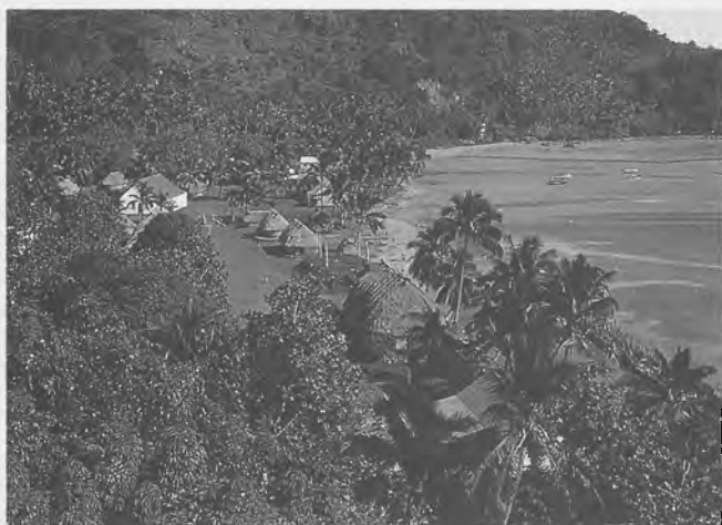
A village on Totoya Island

On another shorter trip I went on the Lady Escott round the north of Viti Levu to visit the Yasawa Islands extending in a chain northwards from Lautoka. One of these was said to be R.M. Ballantyne's Coral Island .