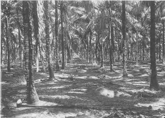
A fine stand of coconut palms

It was assumed, at that time, that Levuana had been introduced to Fiji. It had no parasites there of any significance and had flared up and spread since 1920, from Viti Levu, the main island,