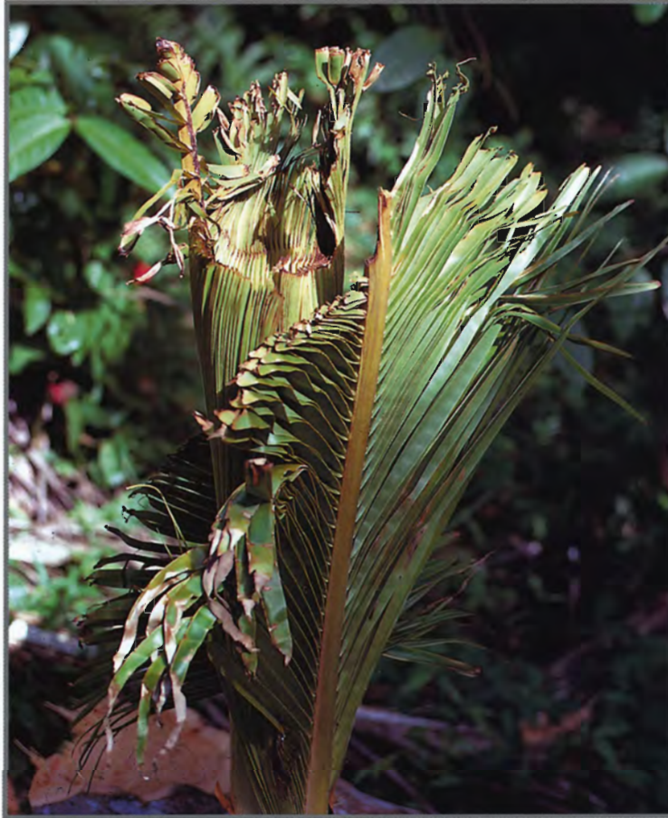
Central leaves from coconut palm with extensive damage by Oryctes centaurus at Daru Island, Papua New Guinea

Simmonds seemed to think they would control the beetle, although they have a very