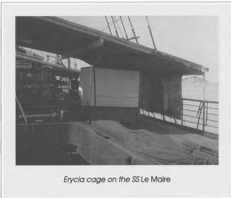
Erycia cage on the SS Le Maire

The ship Wairuna from Sydney, diverted to take me on to Fiji, arrived later than expected and I had to spend five days at Noumea. None of the flies mated at Noumea, but I didn't discover that until I dissected them. We reached Suva on February 27th, just a month after leaving Java. The place was in a dither; the barometer was falling and the wind rose. A hurricane struck the northwest of Viti Levu, but luckily Suva escaped.