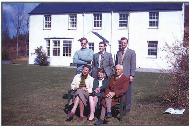
The family at Corran, 1958