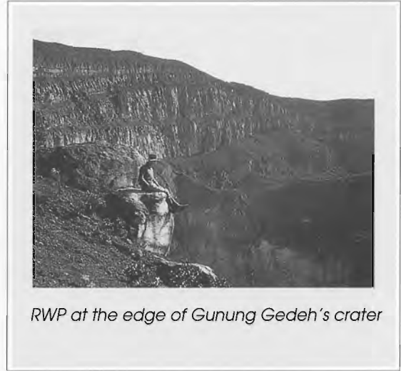
RWP at the edge of Gunung Gedeh's crater

galleries of the Borobudur Hindu temple. Reyne had persuaded me to purchase a small stereoscopic camera, like the one he had. These cameras were not expensive and one could buy the stereo films for them, but these were mostly glass plates, which are heavy to store in any quantity and a bit clumsy to use. For photographing the stone carvings of the Borobudur temple they were excellent. The temple has a beautiful setting among the paddy