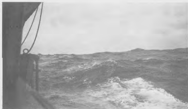
The high seas, from the deck of the Aorangi