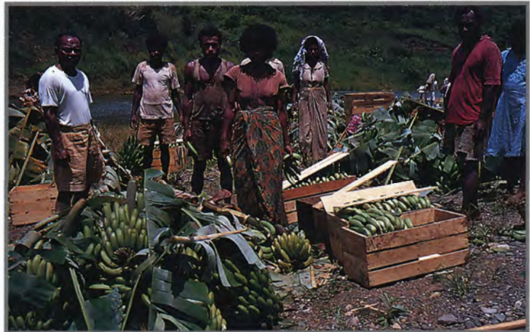
Banana packing station on Wainibuka, Fiji