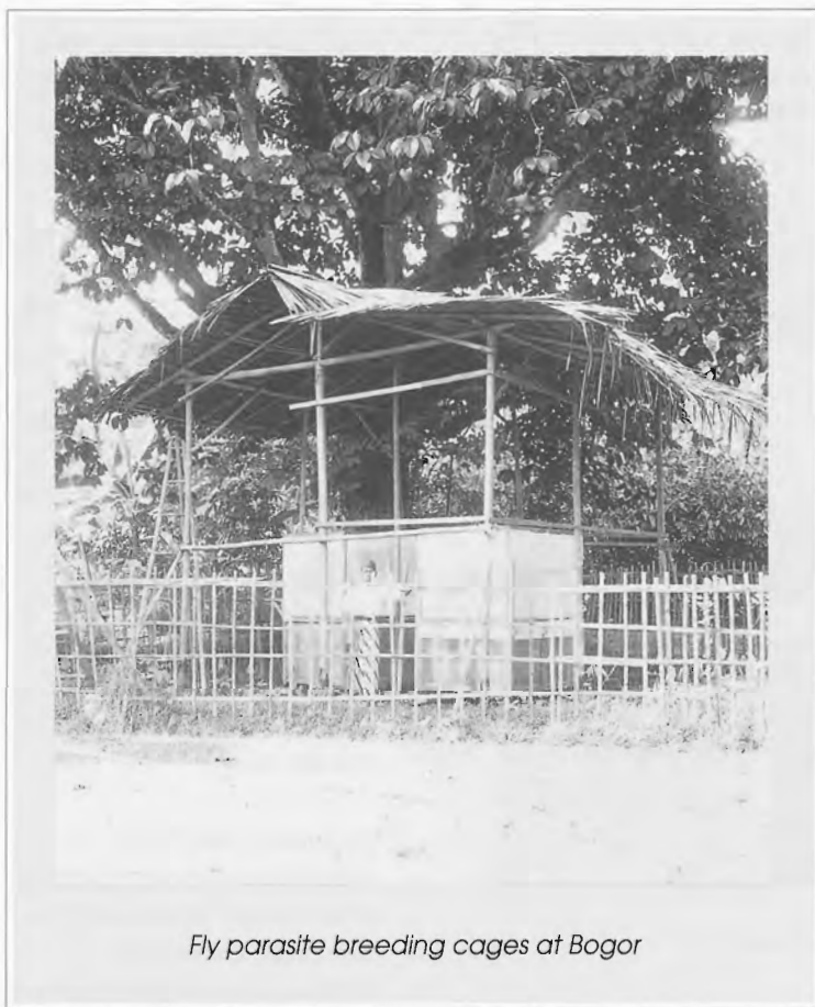
Fly parasite breeding cages at Bogor