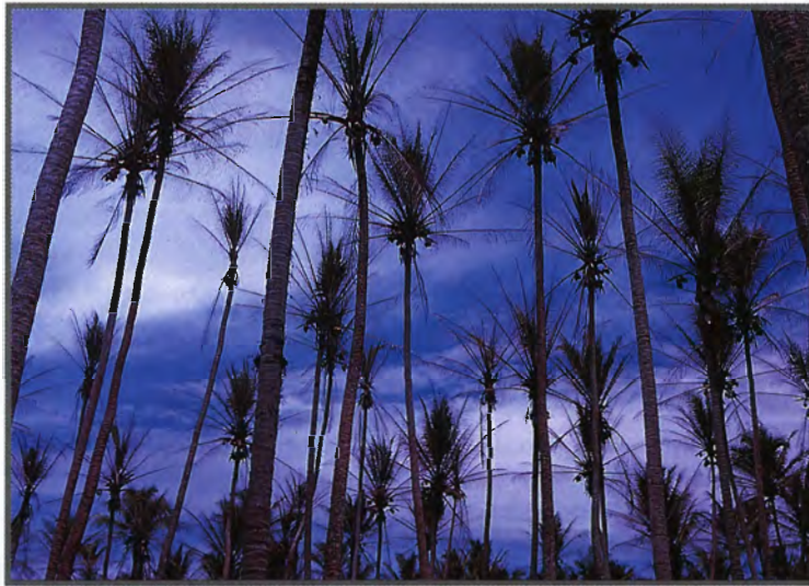
Coconut palms on Vanua Levu, Fiji defoliated by Graeffea

From Suva I visited Navua, where, in a fairly extensive growth of the local sago palm ( Metroxylon vitiense ), there was some stick insect feeding.