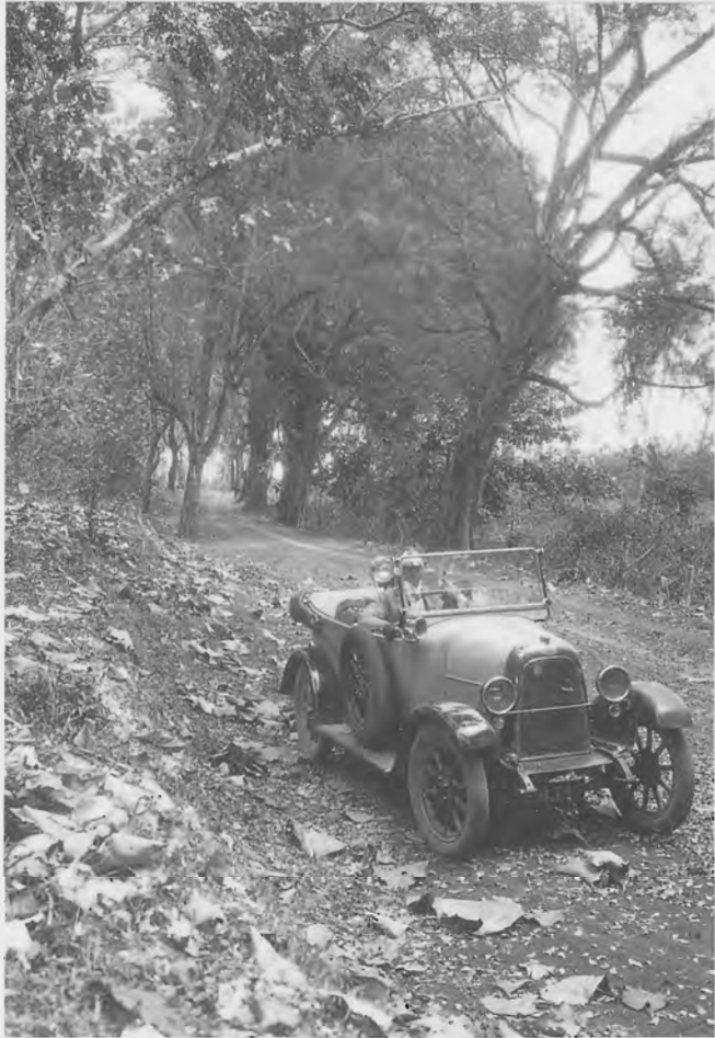
'Bertie', loaded up with Tirathaba larvae, on the road back from the west coast to Bogor in 1930