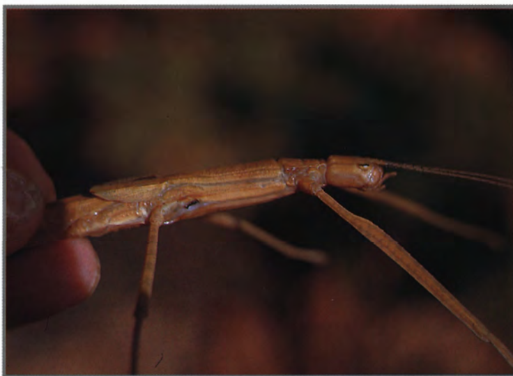
Ophicrania leverii with emergence hole of tachinid species near base of leg

The development of the fly had some interesting adaptations to cope with the