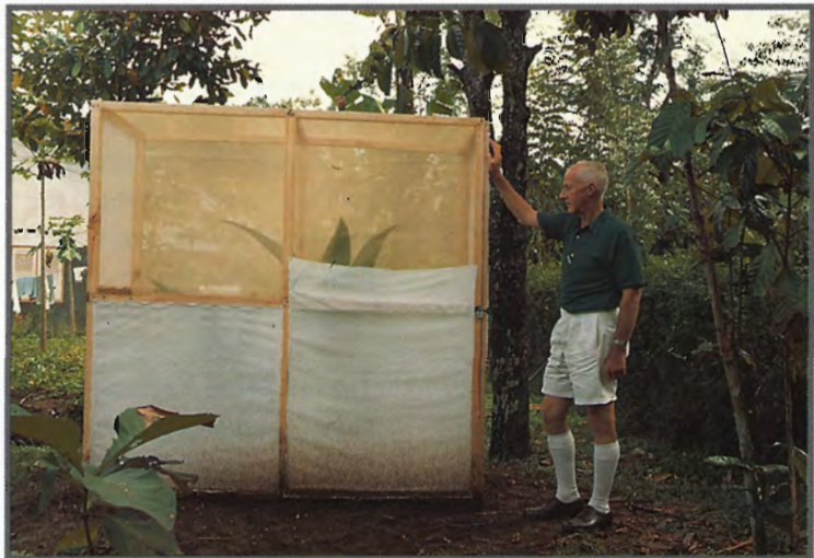
The laboratory at B.P.H.I., Bogor and a Haemolytic breeding cage