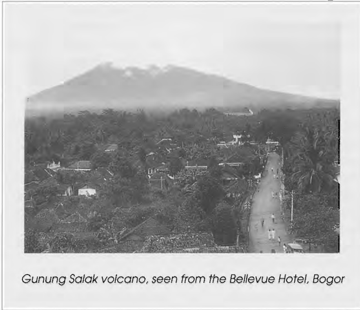
Gunung Salak volcano, seen from the Bellevue Hotel, Bogor

I don't know when international telephone calls were first possible, but I think the Dutch in Java were pioneers of this facility. I was delighted when I was told I could speak to my father on his 60th birthday, December 11th, 1930. I booked a call at 11 pm Bogor time, which was 4 pm in England. I took the call in a phone box and father's voice was very clear and we chatted for four minutes. I felt quite