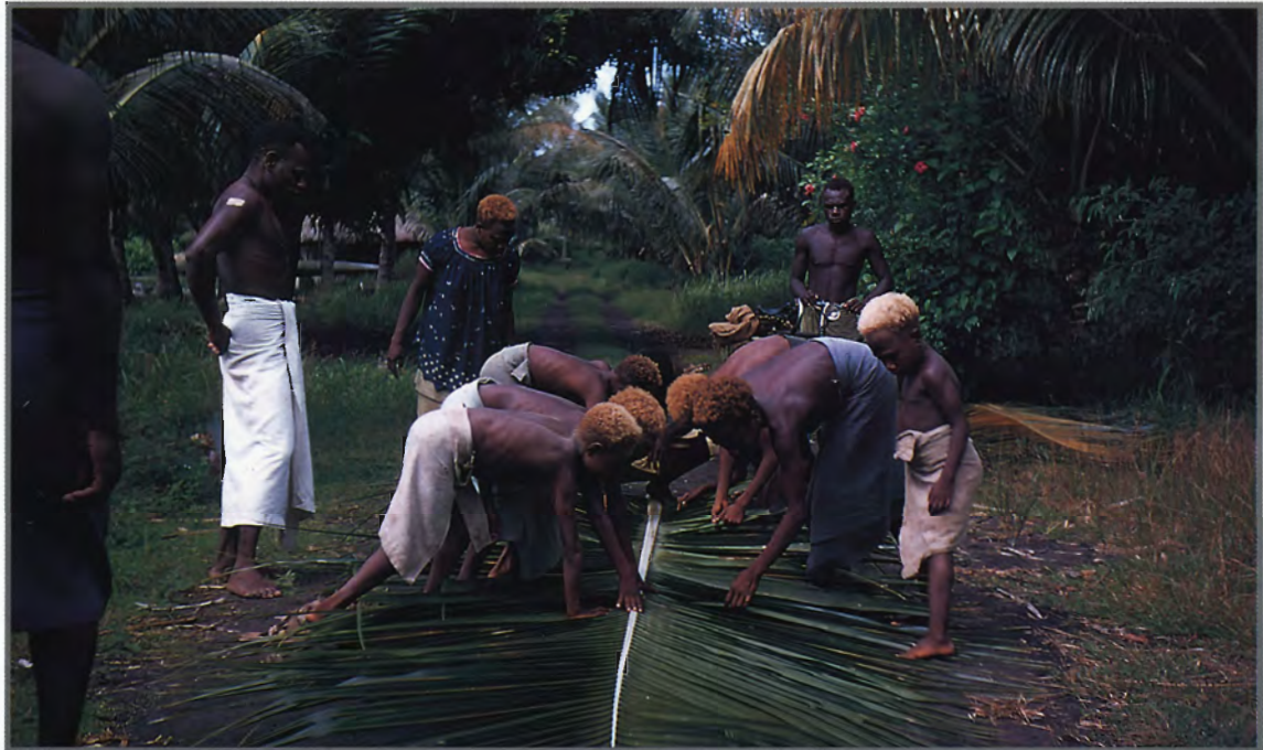
Collecting Agonoxena at Rabual

boys blew across the top of them. With this novel kind of bottle orchestra they gave a recognisable rendering of 'From Greenland's Icy Mountains'. We much enjoyed this diversion and bought some nicely carved wooden tableware, and a pair of little salt and pepper 'people'.