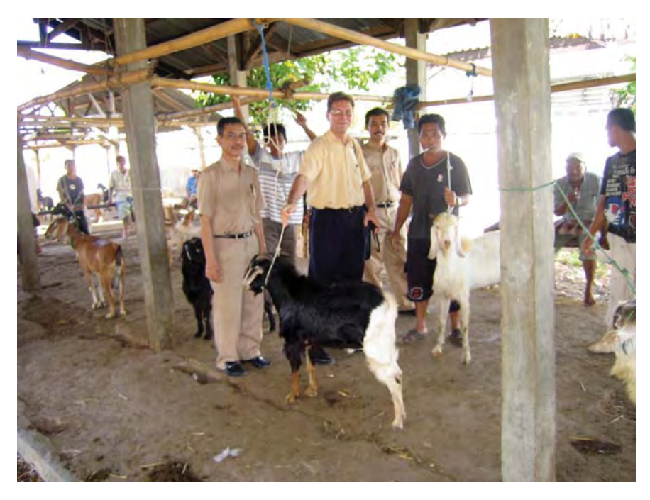
Figure 2. The author and Dinas Peternakan staff at a goat market in Nusa Tenggara Barat

Although some of the markets available are for breeding stock, most demand is for live animals delivered into wet markets for slaughter. Live animal transportation issues, such as ensuring sufficient feed and water are available to reduce live-weight losses during the voyage, minimising handling stress and reducing mortalities, are all areas that could be researched. The possibility of developing markets for meat slaughtered and processed in NTT before delivery, either chilled or frozen, to markets in other parts of Indonesia, could be investigated.