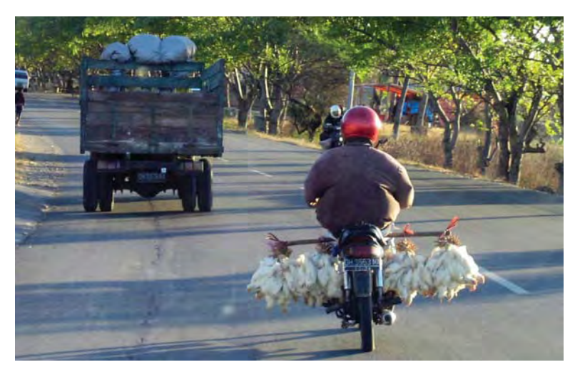
Figure 3. Broiler chickens being delivered to market in Kupang, Nusa Tenggara Timur

The Kupang market handles 7,000–8,000 broiler chickens per day. This has increased from 3,000–4,000 per day 2 years ago. The price of commercially produced live chickens has remained steady at around Rp12,000 each over the same period, despite