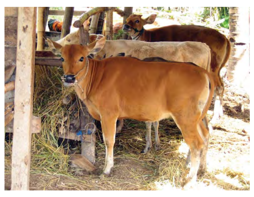
Figure 5. Balinese cattle (sapi Bali): CV Kolompok Usaha Mandiri holding stalls, Desa Gunungsari, Lombok, Nusa Tenggara Timur