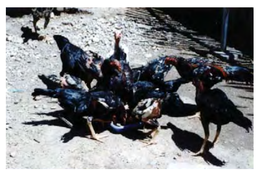
Figure 4. Village chickens in Nusa Tenggara Timur

9,389,207 in 2004, a rise of 32% since 1994, and state that 14,130,760 were slaughtered during 2004, an increase of 32% since 1994. Meat and eggs from village chickens provide the main protein source for the majority of the people in NTT and are highly prized. They are raised mostly for home consumption, but are also sold, mainly at local markets, for their cash income. There was also mention at Balitvet and in NTT, however, that, at some time in the past, village chickens had been exported from Indonesia to Japan and other Asian countries.