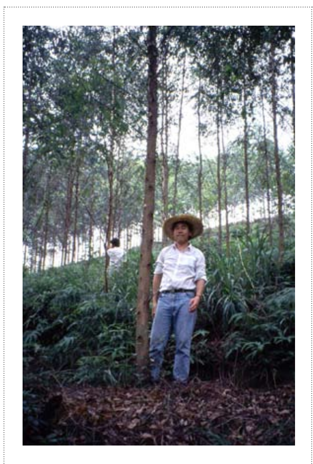
Figure 11. A fertiliser trial in a clonal planting of E. urophylla × E. grandis aged 25 months at Zhenghai State Forest Farm, Guangdong

Research conducted in and after the ACIAR project has produced reliable data on the requirements of trees for the micronutrients B, copper (Cu), iron (Fe), manganese (Mn) and zinc (Zn) in the years immediately following planting, and corrective fertiliser schedules are now available for many soil types (Dell et al. 2003). A manual illustrating nutrient disorders in plantation eucalypts, much of it based on research in China, and prescriptions for foliar analysis, has been produced by Dell et al. (2001). Some companies planting eucalypts in southern China are routinely using foliar analysis to determine nutrients limiting tree growth.