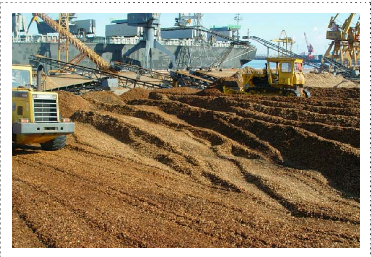
Figure 5. Eucalypt wood chips being exported from Zhanjiang, Guangdong [C. Cossalter]

In western Guangdong, there are large eucalypt plantations on Leizhou Peninsula and adjacent areas in Zhanjiang and Maoming prefectures. It was in this area that the joint venture company Fuxing-UPM Kymmene began, in 2003, to investigate and prepare for wood supplies for a future bleached hardwood kraft pulp mill of 700,000 air-dried tonnes/year capacity (Cossalter 2004). From 2003 to 2007, it planned an overall program of 200,000 ha, of which 45% would be on land with collective and individual user rights, 25% on leased land and 30% under wood supply contracts. Although this region has almost sufficient wood resources to supply a mill of this size, a large part of the resource is committed to other users and much of the mill's wood needs will have to come from new plantations. Land availability is then a problem, as there is competition from several agricultural crops. In November 2004, after studies of local conditions and the availability and cost of wood for a modern largescale pulp mill were concluded, UPM withdrew from the joint-venture company and the future of a pulp mill in the region is uncertain. In southern China, market prices for delivered pulpwood are well above