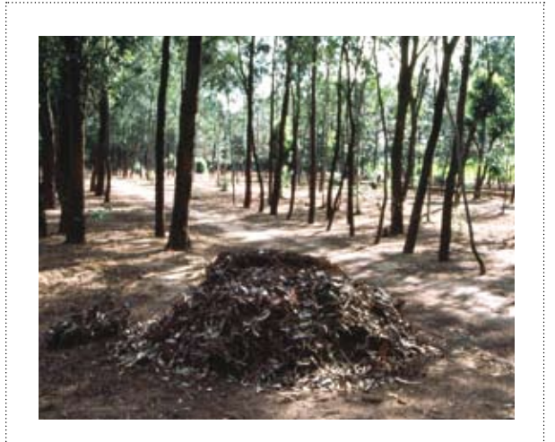
Figure 12. Litter raked for fuel in a Guangxi eucalypt plantation

In Guangxi, Stora Enso managers have indicated that, while the company wants to retain leaf and bark residues on site for soil protection, nutrient recycling and water conservation, they will permit collection of fallen woody branches and woody harvesting residues for fuelwood (UNDP 2006), and some plantation managers elsewhere also tolerate fuelwood collection.