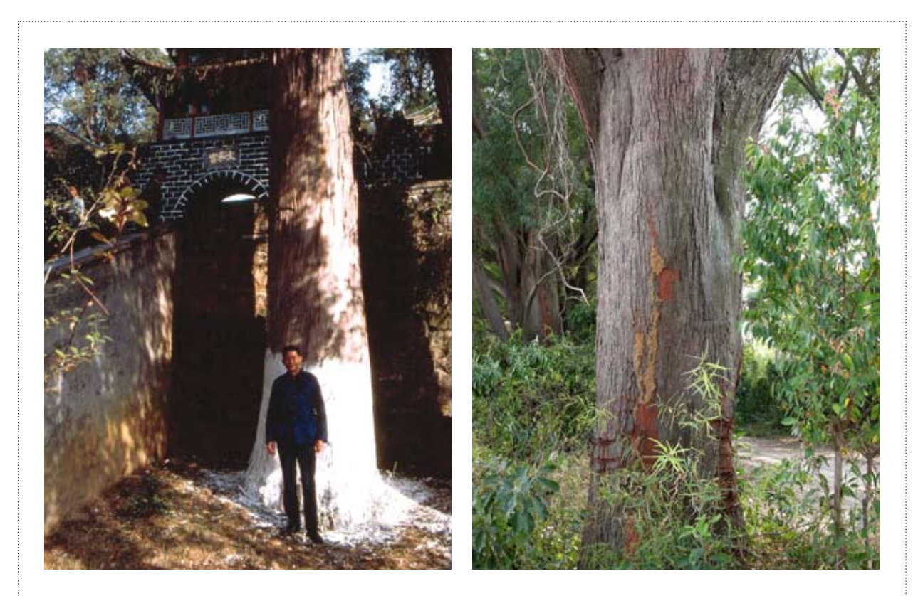
Figure 1. (a) Eucalyptus globulus in the grounds of the Golden Temple, Kunming, Yunnan [J. Turnbull]; (b) E. exserta planted an estimated 100 years ago near a village close to Zhuhai, Guangdong [Wang Huoran]

Large-scale eucalypt plantation programs were initiated in the 1950s, using species already available in China at that time. Widespread failures were common, on account of both inappropriate species–site matching (resulting in severe frost damage in cooler regions) and the lack of site amelioration work and plantation maintenance. Growth rates were poor during the 1950s, averaging less than 7.5 m<sup>3</sup>/ha/year (Wu et al. 1994a; Liu et al. 1996).