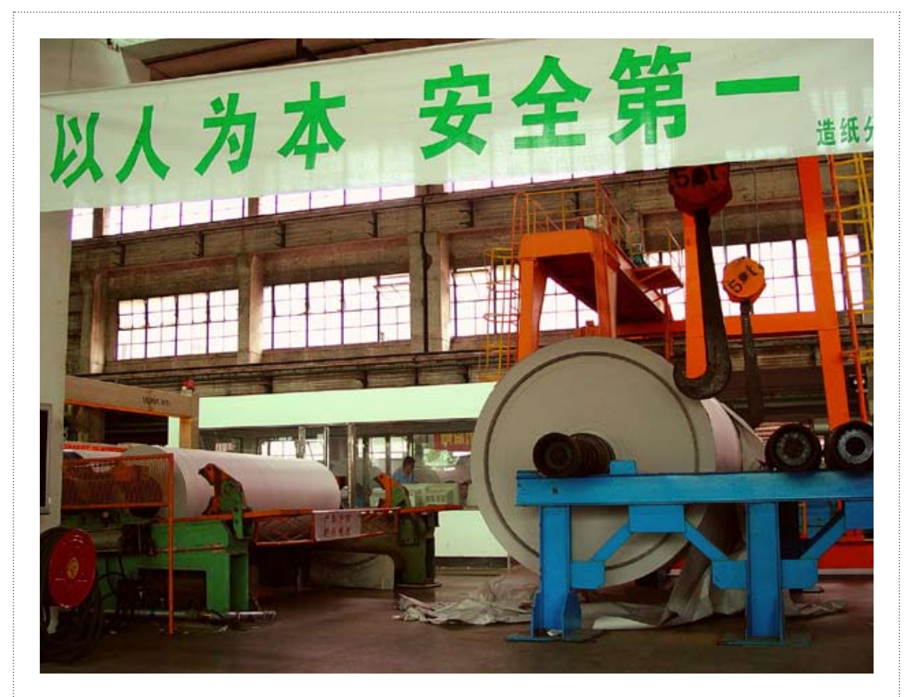
Figure 8. Paper factory in Guangzhou, Guangdong [C. Cossalter]

Although there has been active development of eucalypt plantations in southern China by companies planning integrated forest–pulp–paper industries, they face obstacles in their efforts to secure an adequate plantation land base and it is likely that they will remain largely reliant on imported wood chips beyond 2009 (Cossalter 2004). More extensive planting of coldtolerant eucalypts in provinces such as Fujian, Hunan, northern Guangxi and, possibly, Jiangxi are likely to boost local supplies of wood fibre.