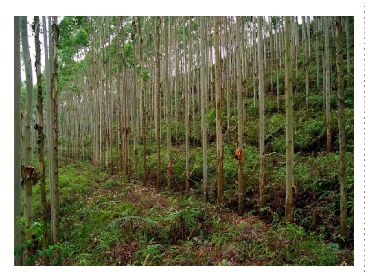
Figure 9. Clonal planting of a hybrid eucalypt for pulpwood production at Pu Bei county, Qinzhou prefecture, Guangxi. Planting distance 4 m × 1.25 m. Expected mean annual increment at end of rotation (6 years) is 26 m<sup>3</sup>/ha/year. [C. Cossalter]

around 7-10 clones of combinations of E. grandis and E. urophylla, and a total of only about 20 clones may have been used in commercial plantations in the whole country (Wang Huoran, Research Institute of Forestry, pers. comm. 2006). Barr and Cossalter (2004) claim that only three clones, i.e. U6 ( E. urophylla × E. tereticornis ), W5 (E. '12 ABL') and E. 'leizhou No. 1' are used in about 90% of the plantations in western Guangdong. There is concern that the rapid expansion of plantations over several provinces has not been supported by the deployment of new clones tested for superior growth and resistance to pests and diseases. The lack of genetic diversity and the failure to deploy new clones are regarded as significant risks to the sustainability of the plantations. A factor contributing to this situation may be that nursery managers often resist the introduction of new clones whose nursery performance is less well known because of their potential effect on total production costs (MacRae 2003).