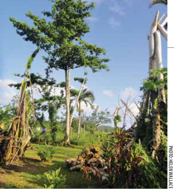
Damage to the Vanuatu landscape following Cyclone Pam.