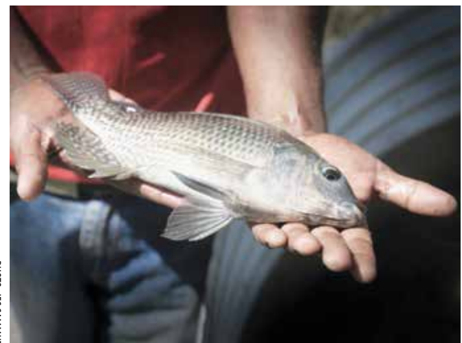
(Far left) Prisoners from Bihute Prison harvesting fish. (Left) St Peter's fish—tilapia. The pidgin word for fish, pis, is a homophone for peace.

Women can also become outcasts because of accusations of sorcery, for which they can be beaten, tortured or killed. Losing a child for no known reason, for example, can result in accusations of sorcery, as can simply falling out of favour with others.