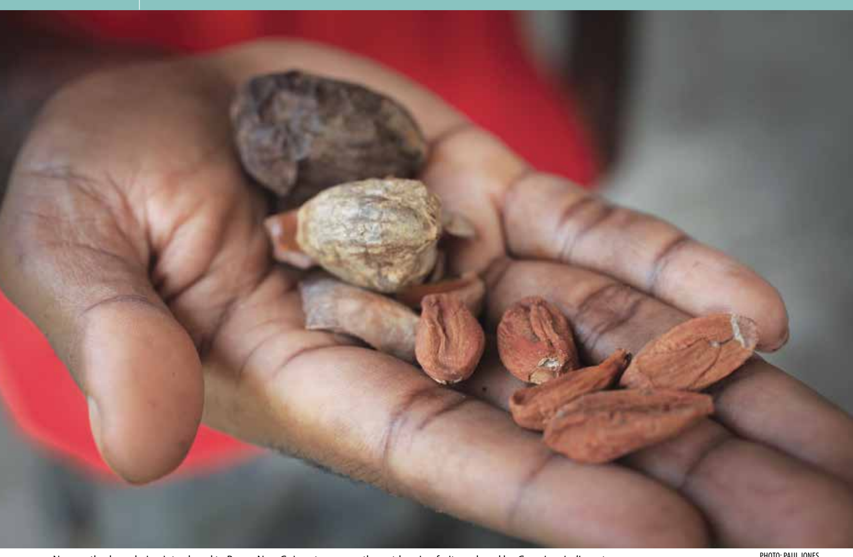
New methods are being introduced to Papua New Guinea to process the nut-bearing fruit produced by Canarium indicum trees.