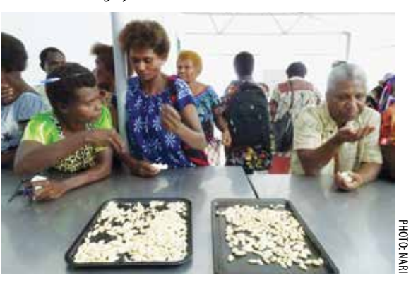
Attendees at the solar dryer training workshop in Papua New Guinea compared the texture and taste of canarium that were insufficiently dried and those that were adequately dried to 1.5% kernel moisture. They also compared nuts that were dried, roasted and salted.

promoting the empowerment and status that come with participating in the development of a new industry.