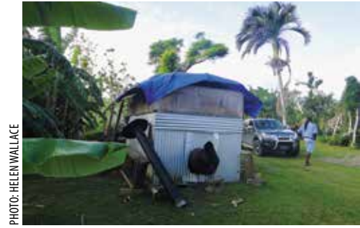
Damage to Vanuatu's industrial canarium-nut dryers and buildings in the wake of Cyclone Pam.

"So I set a target of collecting and processing 2.5 tonnes of cracked nuts this year, mostly from regions that were not badly affected by the cyclone. This will help farmers in these regions to maintain interest in growing and collecting nangai nuts."