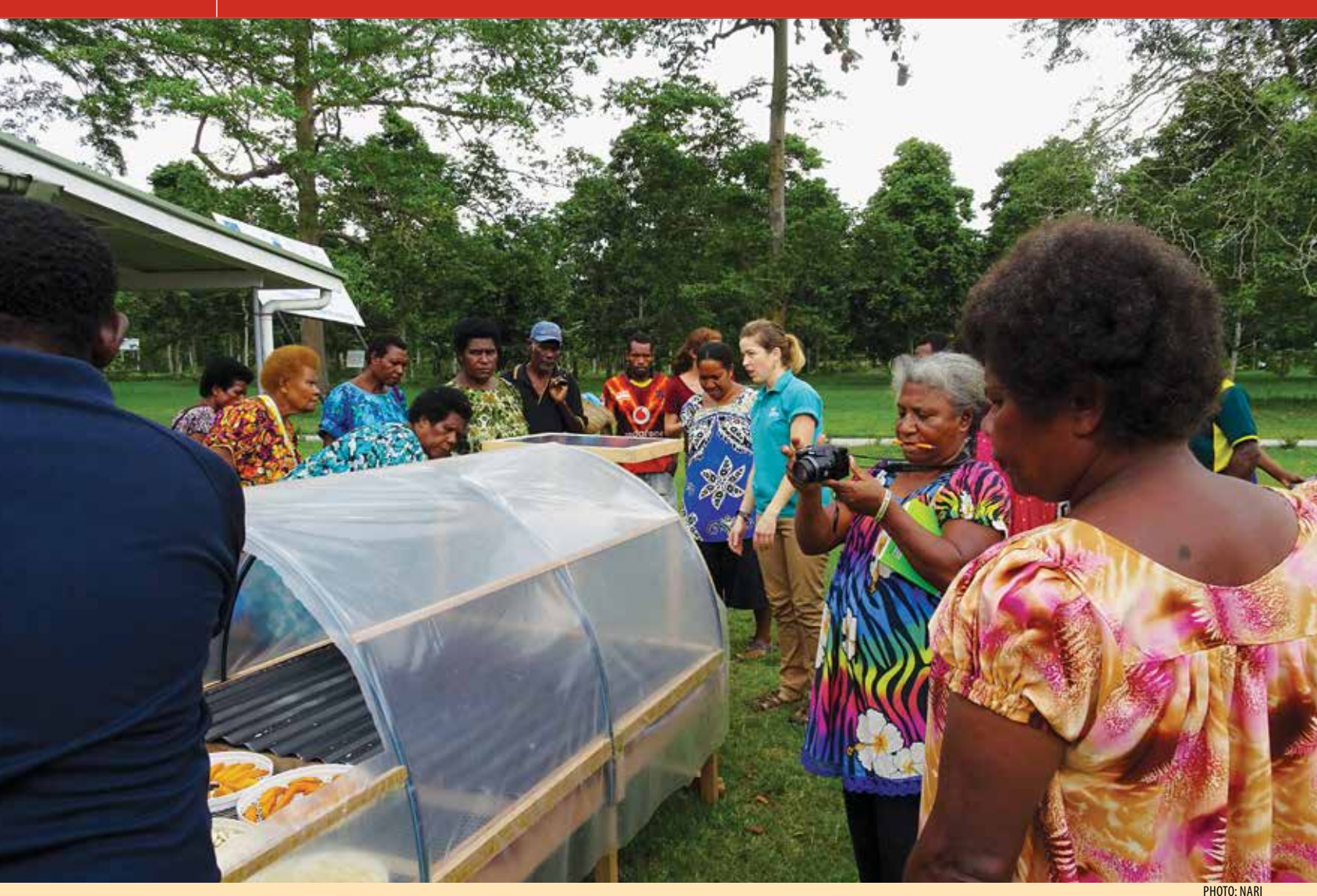
While solar dryers were designed to process canarium nuts, women attending the solar-dryer training workshop in Papua New Guinea were delighted to learn they can be used to dry and preserve fruit, particularly mango.