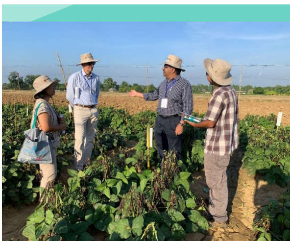
Mungbean experimental lines shown to workshop participants at the World Vegetable Center Research Station in Kamphaeng Saen, Thailand.

WorldVeg presented early results of a study conducted in Southeast Asia showing the large diversity of mungbean production systems and constraints faced by each country. Interestingly, while the topmost constraints in Cambodia relate to the lack of suitable varieties and low-quality seed, the top constraints in Laos relate to low prices and unstable markets, whereas in Vietnam pest and disease are the most important issues. During the workshop, participants presented the status of mungbean production and the different uses and consumption habits (sprouts, bean, added-value products) in their respective countries, and discussed research priorities. The group identified several common areas of interest along the entire mungbean value chain from breeding, seed production and mechanization, to postharvest technologies, processing and the promotion of mungbean consumption. The potential of this highly nutritious, affordable and sustainable crop to improve farmers’ incomes and family nutrition in the region is enormous.