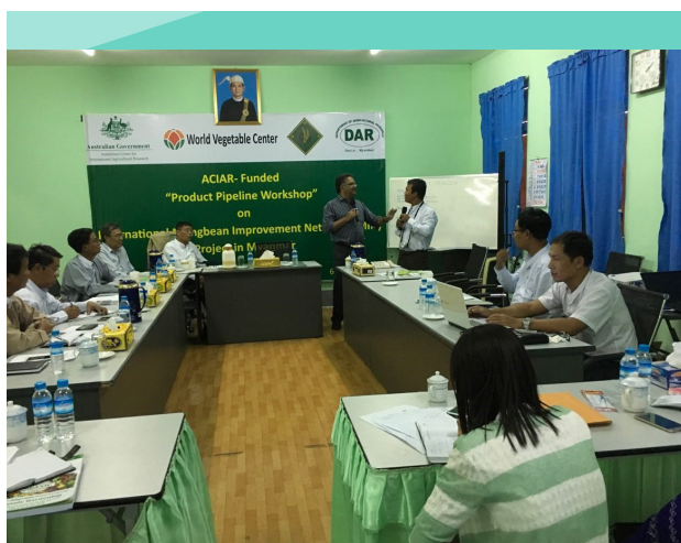
Mungbean Product Pipeline workshop in Myanmar attended by major stakeholders

The workshop deliberated on market strategies for mungbean in Myanmar. Due to restrictions from the Indian market, Myanmar is exploring new market opportunities in China, Japan, European Union and United Arab Emirates. In order to reach these markets, the 'Myanmar Mission Export Strategy' outlines that the increase of mungbean yield for export will focus on improved agricultural practices including good nutrient management. Currently, one of the major issues faced by the farmers in exporting mungbean is the use of banned chemicals and their residues on produce. The workshop also discussed the need for developing varieties that are suitable for the sprout market and also varieties that are suitable for mechanical harvesting. These varieties will be important in the regions with limited availability of labour at harvest time, leading to the reduced cost of production. Though mechanical harvesting has been started in some pockets of Myanmar, farmer trainings/awareness programs are needed to expand it. Overall, better dissemination of newly released varieties and adoption of Good Agricultural Practices by farmers are required to address these challenges.