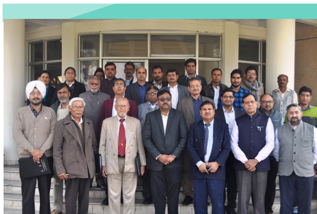
Participants of the Mungbean Stakeholders Workshop 10 th -11 th February 2019

Discussions from this workshop concluded that that mungbean varieties with the thin seed coat and bright yellow cotyledon are most preferred by the consumers, dal millers and snack manufacturers. Summer-grown crop also is more preferred compared to Kharif or Rabi crop because of its uniform seed size, high grain quality and reduced moisture content. The major recommendations of the workshop included an increased focus on breeding for medium grain size (3.4-4.2 g/100 seed), pre-harvest sprouting tolerance and bruchid resistance, restructuring plant types for mechanical harvesting, increased involvement of the private sector in R&D and promoting custom hiring for farm mechanization. It was unanimous amongst the group that mungbean in India is known for its olfactory properties and breeding specialty mungbean varieties with these qualities are required. The workshop ended with a pledge to promote mungbean to improve the socio-economic conditions of the farmers.