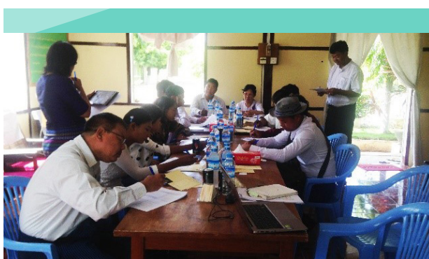
One of the mungbean workshops held in Myanmar

The results show that improved varieties are planted on 94% of the mungbean area in Pakistan, 87% in Myanmar, 81% in India, and 72% in Bangladesh. The table shows the five most important mungbean varieties per country. Breeding lines developed by the World Vegetable Center are widely used and account for 93% of the mungbean area planted in Pakistan, 77% in Myanmar, 27% in India, and 67% in Bangladesh. The study estimated that WorldVeg varieties are planted on 1.7 million ha of land and, based on average planting areas per farmer, reached 1.2 million smallholder farm households.