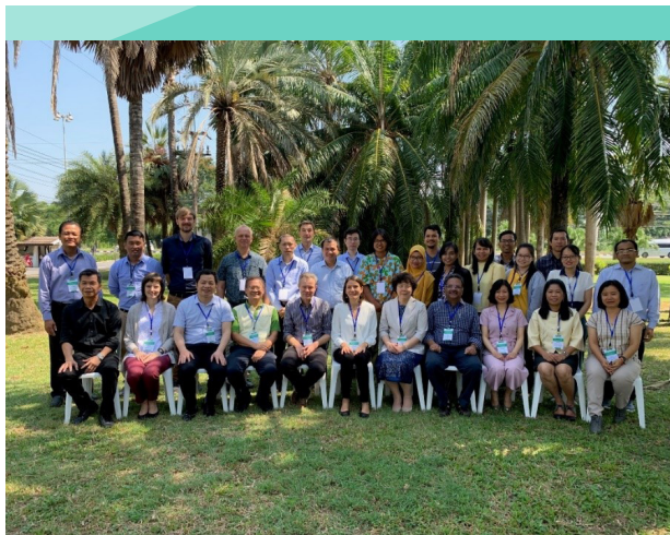
Participants of the regional workshop “Enhancing farmers’ access to improved mungbean varieties and good agricultural practices in Southeast Asia” held on April 23-24, 2019 at the World Vegetable Center, East and Southeast Asia Regional Office, Thailand.

The workshop informed participants about the current status of the WorldVeg mungbean improvement program and demonstrated a selection of mungbean lines from World Vegetable Center and Kasetsart University, which should enable mungbean breeders in the region to identify germplasm for use in their improvement programs. Although overall demand for mungbean is rising in the region, only very few mungbean experts are present in each country. Participants saw significant benefits (e.g. mutual learning, international networking, development of collaborative research projects, exchange of germplasm and varieties) of international collaboration, and agreed to meet on a yearly basis and mobilize financial resources to support common projects. Hence, the obvious question is: Shall we expand the existing International Mungbean Improvement Network (IMIN)?