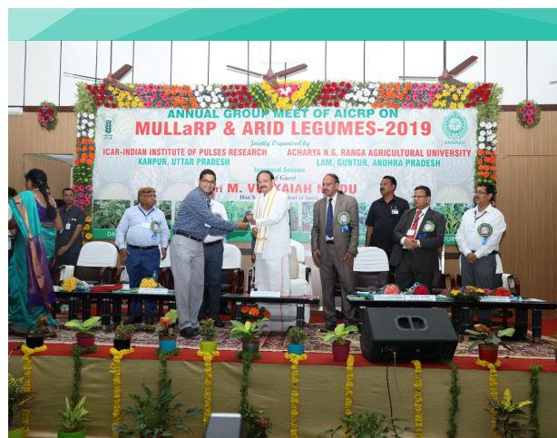
Launch of Mung Advisor app by Shri. M. Venkaiah Naidu, Honourable Vice President of India